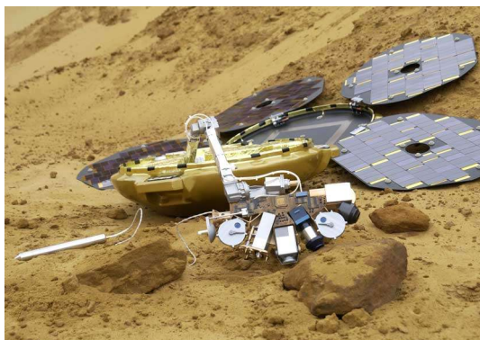
Figure 1: Beagle 2

On December 25th, 2003, a small lander, travelling with the Mars Express orbiter, was expected to land on Mars surface. Unfortunately, as with a high proportion of Mars landers, the Beagle 2 lander was unsuccessful. Various explanations of its failure have been proposed, including the possibility that the density of the Martian atmosphere is not as high as had been thought and, as a result, the parachute-brake failed to slow the lander sufficiently before impact. Despite this major setback, the design of the lander is considered so innovative and efficient (both in terms of cost and in terms of science-to-mass) that a future repeat attempt is being seriously considered. Funded by the European Space Agency, the authors have explored the possible roles of planning technology in space operations [13]. The project includes examining interactions between human operations planners and automated technology, initially in the context of operations plans for Beagle 2. Considerable expertise was built up around the Beagle 2 systems, including a partial domain model for human planning operations, and this has formed the core of a project to exploit planning technology to support mixed-initiative and partially automated planning for the lander operations.