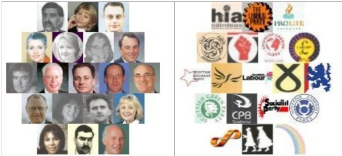
Candidates from Aspect (left) and Party Logos from Aspect (right)

Aspect is digitising political pamphlets from the first Scottish parliament elections in 300 years.