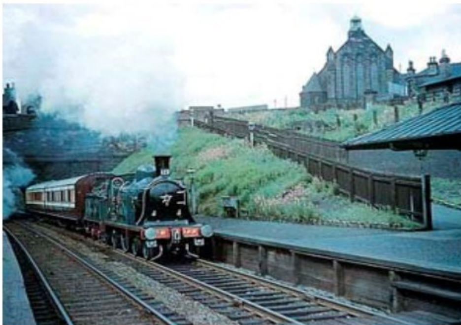
Caledonian Railway engine no.123, built 1886, from Springburn Community Museum

Aspect is digitising political pamphlets from the first Scottish parliament elections in 300 years.