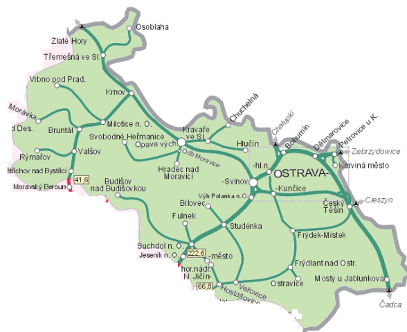
Fig. 2 Map of railway system of Moravian-Silesian Region (České dráhy, 2010)

From the above-mentioned characteristics, it is clear that any accident in this territory would have serious consequences influencing human life and health and causing damage to property, traffic flow interruption and environmental threats.