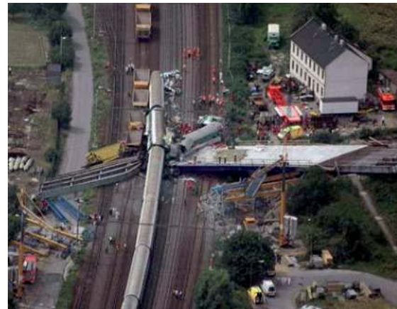
Fig. 4 Photo of Studénka train accident

crashed into the structure of a road bridge being repaired, which had fallen on the railway track several seconds ago (see Fig. 4).