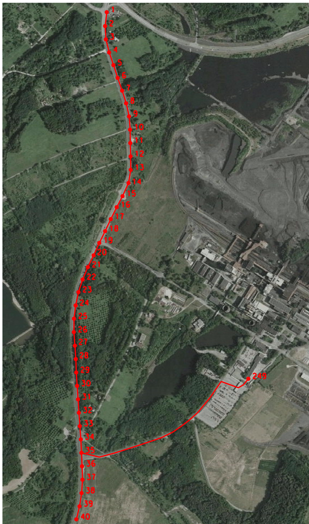
Fig. 2 Height attachment of the line observation station