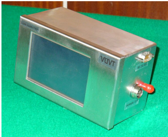
Fig. 2. Prototype 2

Prototype 2 (Fig. 2) is the smallest one in the standard series. It belongs to mobile devices. The supply and filter systems are adapted due to the demands. The prototype input power is minimized. Monochromatic graphic LCD display 6,4 " placed in a ferromagnetic cage and the low power industry computer PC/104 create one unit. Performance of processor Vortex86 is 500 MHz, resolution of LCD panel is 240 x 128 pixels.