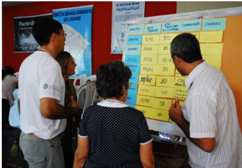
Figure 1. Exhibiting promises on index cards during one of the Pact workshops.

regional pacts. At this level, institutions could combine resources to fulfil each other's promises and address larger initiatives such as the construction of water treatment plants or solid waste management systems. Finally, representatives from each municipality [End page 37]