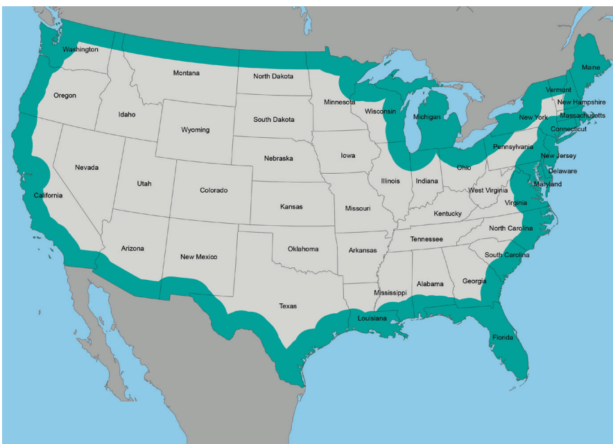
FIGURE 2 — TERRITORIAL DEFINITION OF THE BORDER FOR U.S. FEDERAL LAW ENFORCEMENT PURPOSES