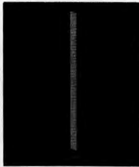
Fig. 5 Free condition of design of steel material, analysis model