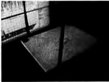
Fig. 9 Free condition of ceramic design, experimental measurement

Natural frequency of all three materials specimen was measurement in free and in constrained condition (Fig. 9 – Fig. 14).