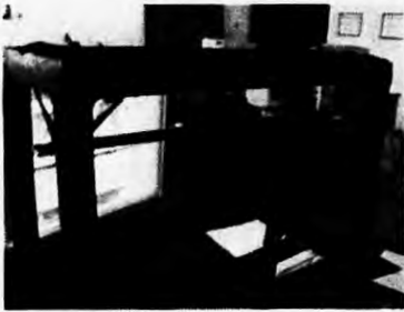
Fig. 13 Free condition of design of steel material, experimental measurement