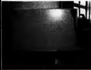
Fig. 10 Constrained condition of ceramic design, experimental measurement