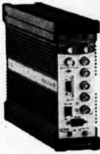
Fig. 7 Systém PULSE 3560B