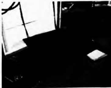
Fig. 11 Free condition of laminated design, experimental measurement