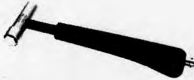
Fig. 8 Modálne kladivko typ 8206-002

Natural frequency of all three materials specimen was measurement in free and in constrained condition (Fig. 9 – Fig. 14).