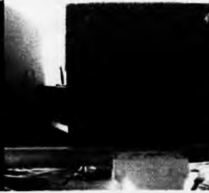
Fig. 12 Constrained condition of laminated design, experimental measurement