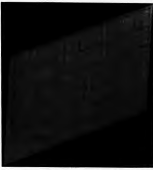
Fig. 3 Free condition of laminated design, analysis model