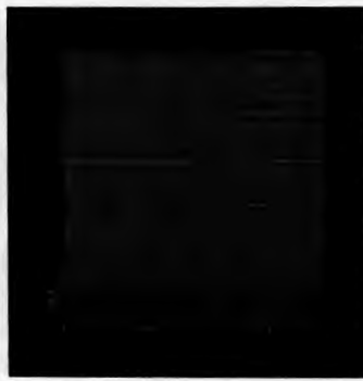
Fig. 4 Constrained condition of laminated design, analysis model