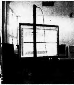
Fig. 14 Constrained condition of design of steel material, experimental measurement