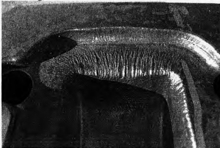
Obr. 3.1 Detailní pohled na opotřebení kovací zápustky Fig. 3.1 Detailed view of a forging die wear

Through operational verification of the examined material of steel grade according to X38CrMoV5-1, which forging die bodies were made from, its continuous standard durability has been confirmed. Fig. 3.1, shows damaged basic dimensions of the die's edge parts which were the decisive reason for discarding.