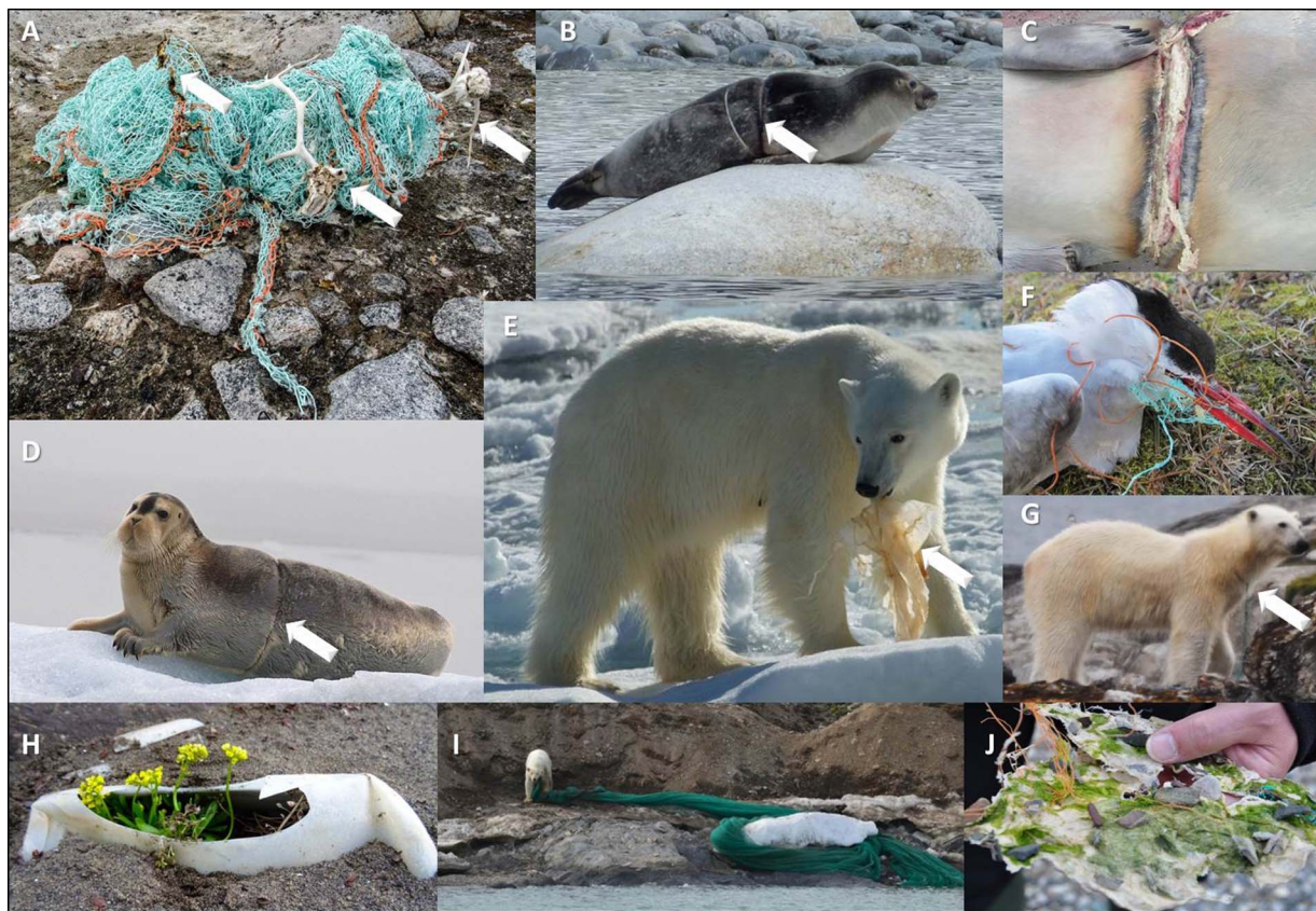
Fig. 2. Images taken by citizen scientists showing interactions of Arctic biota with marine litter on Svalbard beaches: (A) fishing net entwined with fucoid macroalgae and two entangled antlers and skulls of reindeer ( Rangifer tarandus platyrhynchus ) from Chermisøya (Nordaustlandet); (B) harbour seal ( Phoca vitulina ) entangled in rope cutting through the skin, (C) causing severe wounding; (D) bearded seal ( Erignathus barbatus ) with rope tied around its belly in the Hornsund/Bellsund area; (E) polar bear ( Ursus maritimus ) with plastic shred in its mouth on ice floe in Hinlopenstreet; (F) dolly rope fibers wrapped around the beak of a perished Arctic tern ( Sterna paradisaea ); (G) polar bear with fisheries rope tangled around its neck in the Raudfjord area; (H) Arctic whitlow-grass ( Draba bellii ) in contact with plastic container; (I) polar bear with beached fishing net at Sorgfjorden; (J) conglomerate of green algae (cf. Ulva spp.) and dolly rope fibers.

Recently, skulls of reindeer ( Rangifer tarandus platyrhynchus ) entangled in fishing nets deposited on the beaches of Svalbard have become a regular sight (Fig. 2A). In the absence of more suitable food