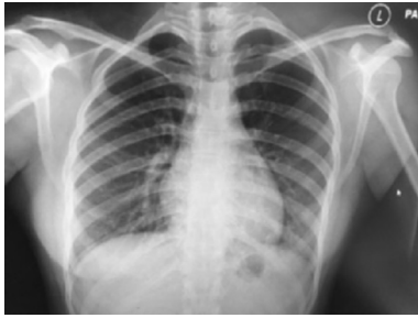
Fig. 1. Normal chest X-Ray.