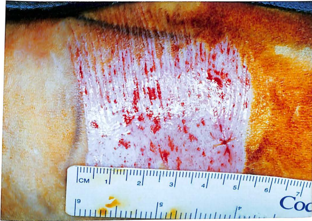
Figure 6: Wound size was approximately 5X2.5 cm