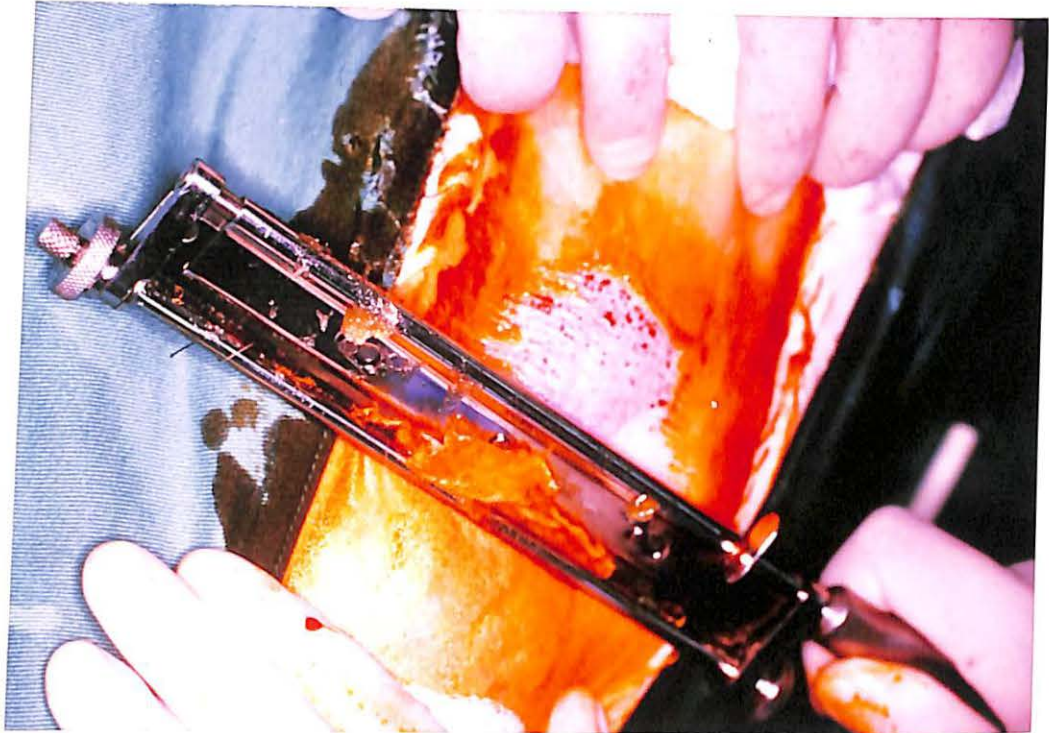
Figure 5: Humby knife sliced the skin till 0.6 mm deep to create a partial thickness wound