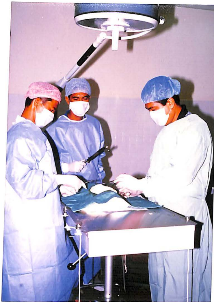
Figure 3: All procedures were performed under aseptic technique.