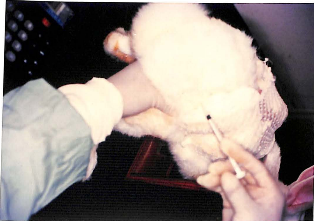
Figure 2: Anaesthetic agents was injected intramuscularly (buttock area)