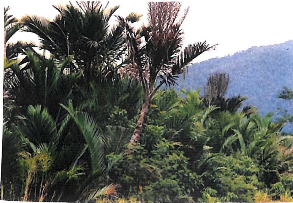
Sago palms ( Metroxylon sagu ) in wetland of Sarawak.