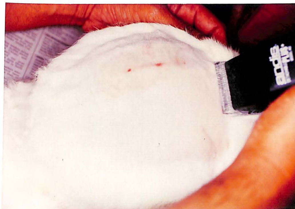
Figure 1: Back and both flanks were shaved .