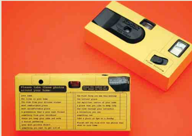
Figure 1: A disposable camera repackaged with requests for specific pictures.