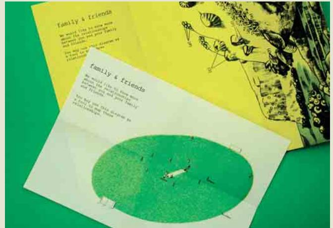
Figure 2: A friends and family map based on Dante's heaven and hell.