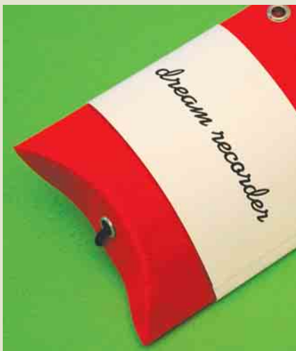
Figure 3: The Dream Recorder , a cheap digital memo-taker

The Probes simultaneously make the strange familiar and the familiar strange, creating a kind of intimate distance that can be a fruitful standpoint for new design ideas. They produce a dialectic between the volunteers and ourselves: On the one hand, the returns are inescapably the products of people different from us, constantly confronting us with other physical, conceptual, and emotional realities. On the other hand,