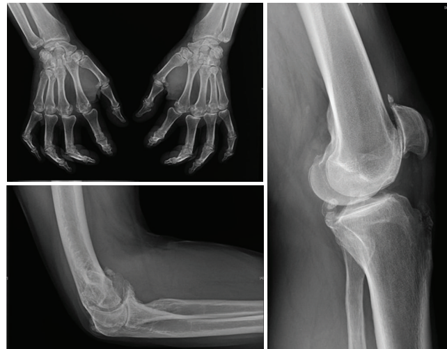
FIGURE 3: Metacarpal heads osteophytes, MCPs subluxations, and joint narrowing; calcifications of patella and elbow.