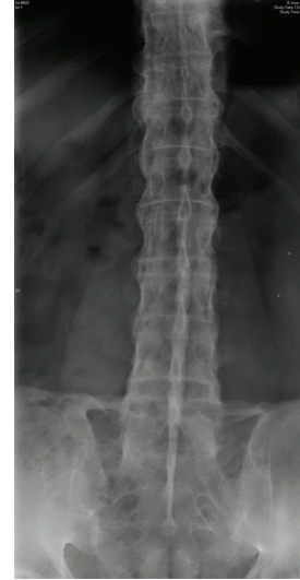
FIGURE 1: Lumbar spine and iliolumbar ligament calcification.

2.2. Case Report 2. A male patient developed swelling and pain in the MCP joints and proximal interphalangeal joints (PIPs) III, IV, and V of both hands when he was 30 years old, followed by pain in both knees, elbows, and shoulders.