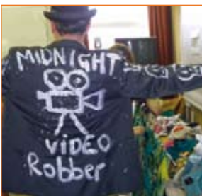
Midnight Video Robber

"Carnival provides opportunities for all pupils to achieve, including pupils with special educational needs. The excitement of carnival and all its art forms motivates the children, increases their confidence and encourages them to get involved. Carnival provides an opportunity to celebrate children's achievements. This was my experience working with the children on Carnival themes." (class teacher)