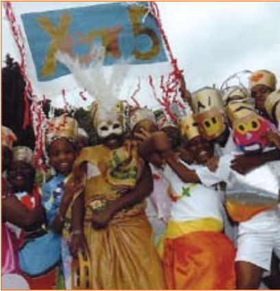
Carnival day at school

teachers and artists to show to children in schools and to teachers at staff meetings.