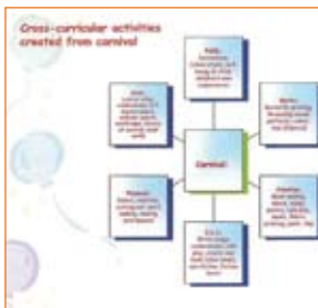
Early years curriculum map from students planning