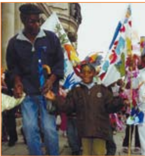
Parents and children in carnival on the streets