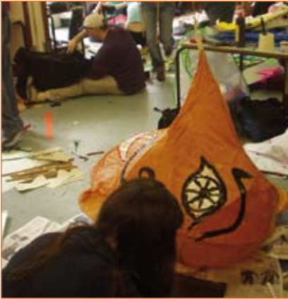
The challenge of scale