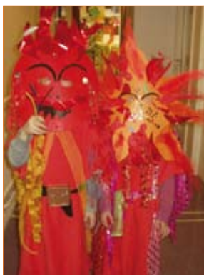
Students' children took part in the workshops

"Nowadays we need to be more aware in planning creative and performing arts that we can't just draw on English culture-in fact there is no such thing as 'English' culture now you have to draw on all the influences on all the things that are influencing children and making them who they are. I mean when I came out of school I had no knowledge of any other culture. It wasn't seen as important but it is. You need to be aware... and it makes things so much more interesting and it is a more exciting way to execute the curriculum."(student)