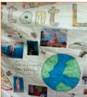
Banner made by parent group