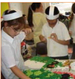
Developing skills in D and T

in that it is recreative because the song already exists, but to write a song is to create it from nothing and the experience of creating from nothing except just an idea is very very enriching." (artist)