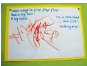
Costume design from a nursery school