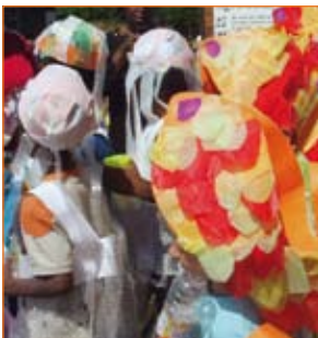
School carnival parade

sense of achievement when the performance took place.