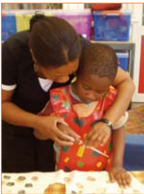
Carnival arts motivates children