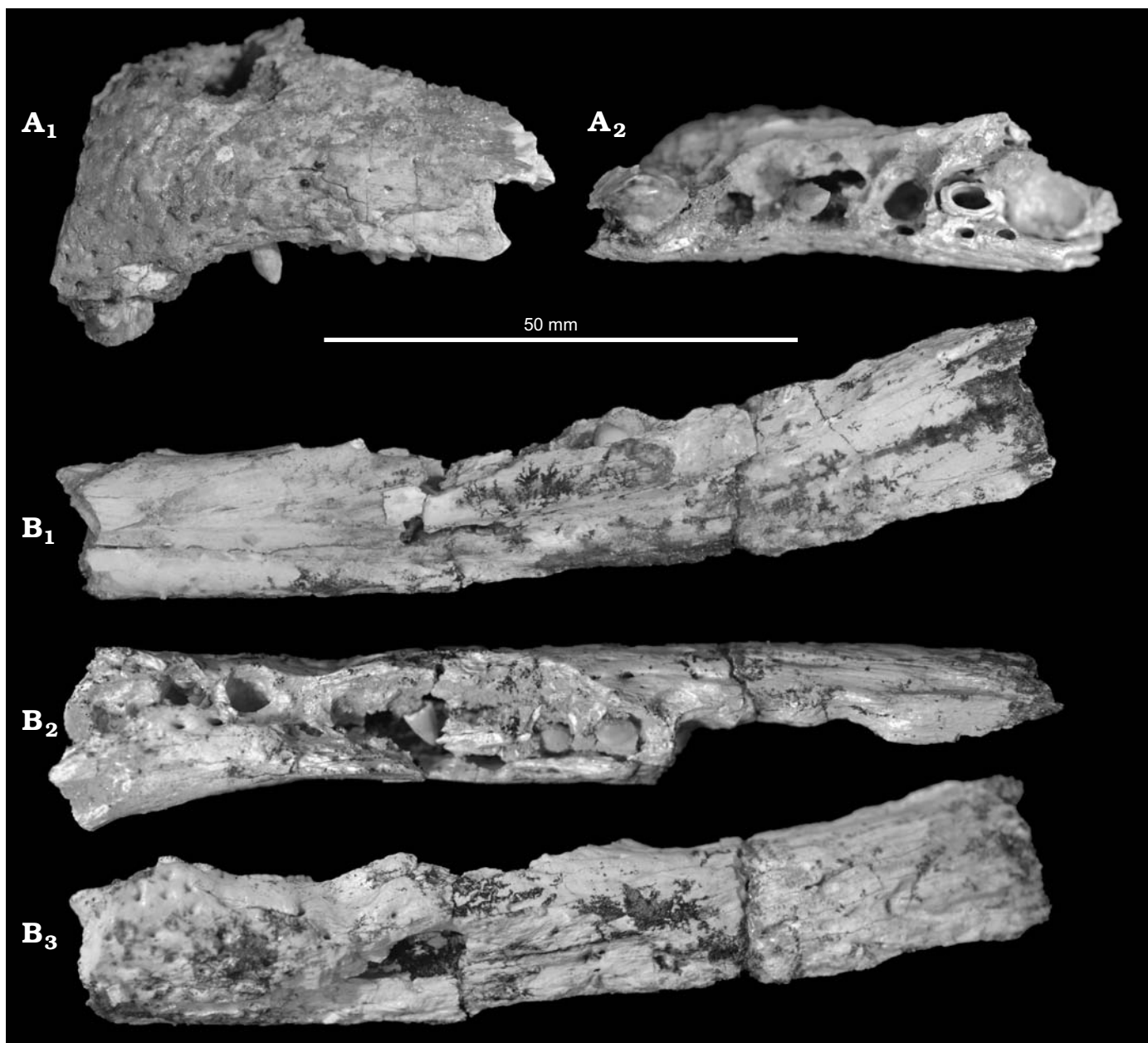
Fig. 1. Rostra of mekosuchine crocodile Mekosuchus whitehunterensis Willis, 1997; White Hunter Site, Riversleigh World Heritage Area, northwestern Queensland, Australia; late Oligocene. A. Left maxilla (QM F56046) in buccal (A 1 ) and ventral (A 2 ) views. B. Left dentary (QM F56047) in lingual (B 1 ), dorsal (B 2 ), and buccal (B 3 ) views.

nous process is missing. The hypapophysis is reduced in size compared to those in the cervical vertebrae but inclines anteroventrally to a similar degree as the ninth cervical vertebra QM F56043. The NCS displays the closed state. Two small pits are visible ventral to the NCS on the right side, but these appear to be the result of post-mortem pitting of the surface unrelated to the NCS.