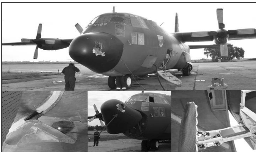
Photo 1. Damages caused by lightning on a military aircraft

After landing, when the aircraft was parked, the flight crew and the maintenance crew have noticed that the aircraft was struck by lightning in its forefront area, namely in the radom box accommodating the radar system, where the lightning encountered the lowest resistance. (Photo 1).