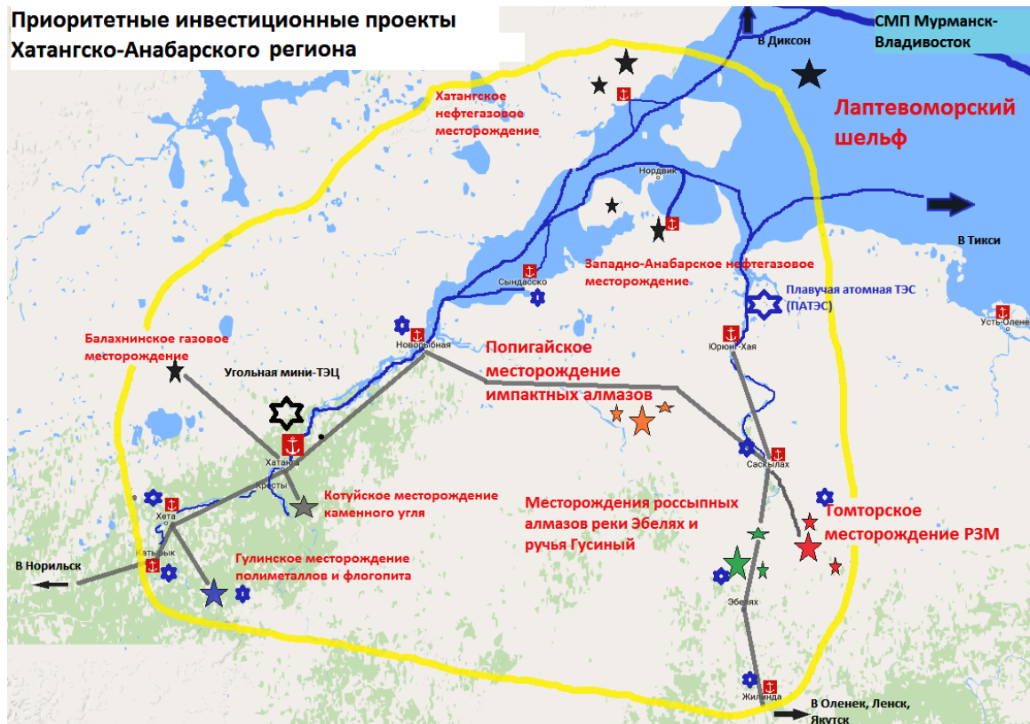
Figure 1. The review scheme of the projects of development of mineral raw resources of the Khatanga-Anabar region.

development of deposits of alluvial diamonds of Ebelyakh-Gusiny; the development of Kotui coal deposit; the development of Popigai field of impact diamonds (Fig. 1).