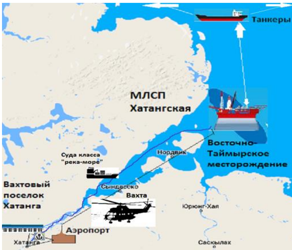
Figure 3. The development of transportations and service in the Khatanga rural settlement during the development of offshore hydrocarbon fields

The pace of development of the Khatanga transport and logistics center will be determined by the timing and scale of the development of oil fields. Bearing in mind that the practical implementation of the oil project is expected not earlier than 2020-2025, the creation of transport and logistics center Khatanga should be divided into two phases: the first (till 2020-2025) to ensure the reconstruction and modernization of existing infrastructure, the second (after 2025) to proceed to increase its capacity and expand the composition — to form the repair and maintenance base of commercial and specialized fleet; to arrange the base of creation and maintenance of high-latitude expeditions; to organize tourist routes with the development of an appropriate infrastructure.