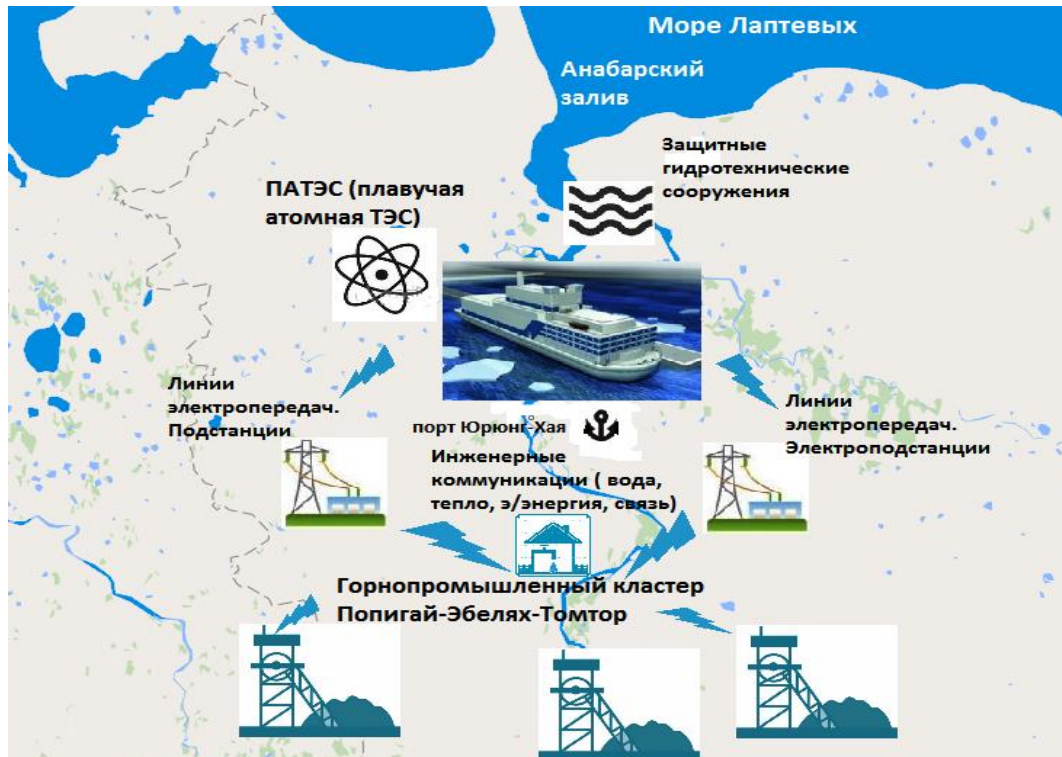
Figure 5. Floating nuclear thermoelectric plant (FNTF) in Yuryung-Khaya port

Preliminary estimates show the feasibility of the formation of two autonomous power units based on Khatanga coal power generation and Anabar small nuclear power station (SNPP). In the first case the construction of co-generation plant with the capacity of 10-15 MW in Khatanga will be required, in the second — the placing of SNPP on the base of floating power unit (FPU) with reactor unit equipment KLT-40C (Figure 5.).