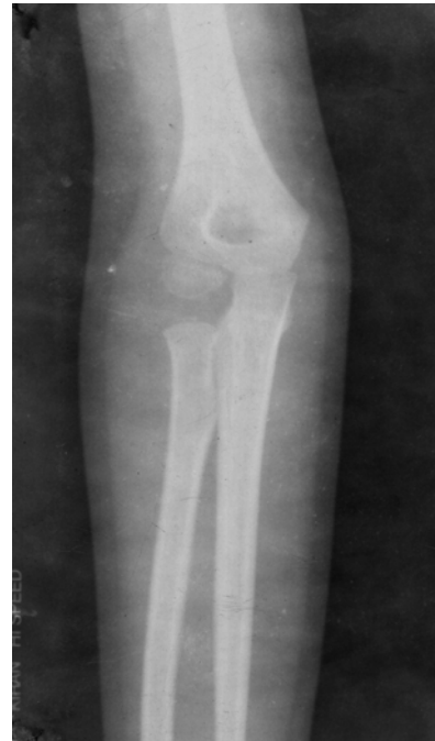
Fig. 1b: Anteroposterior radiograph of elbow.