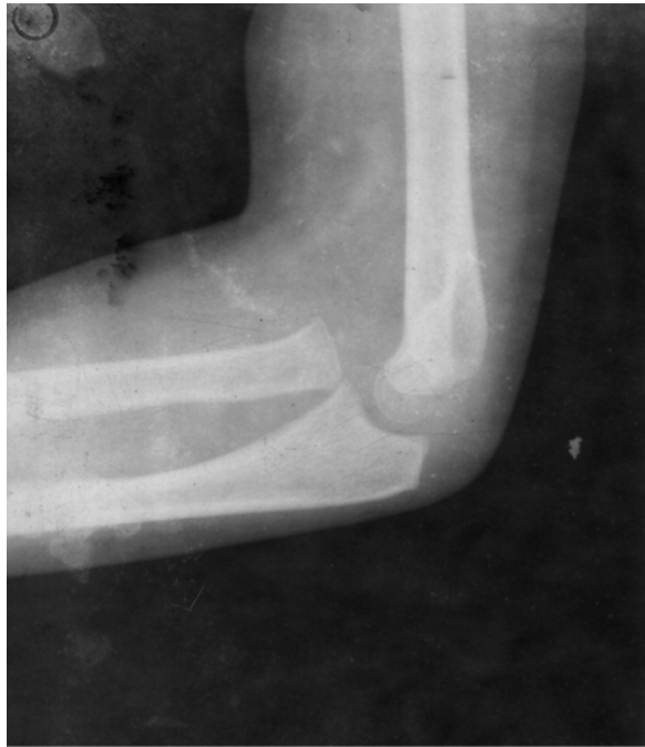
Fig. 1a: Lateral View radiograph elbow Showing anterior dislocation of radial head.