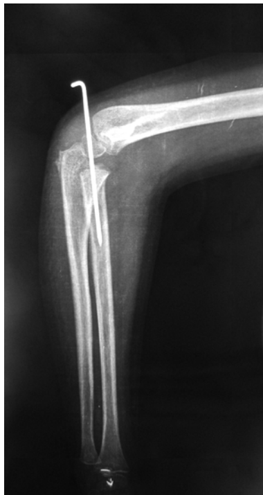
Fig. 4a: Post operative lateral radiograph.