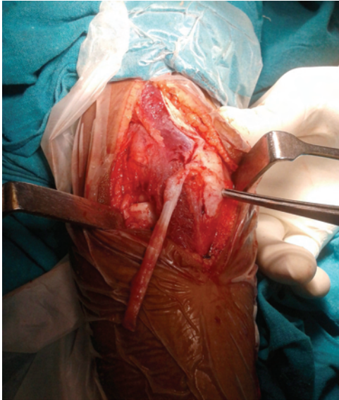
Fig. 3a: Intra-operative photo showing harvested lateral border of triceps aponeurosis.