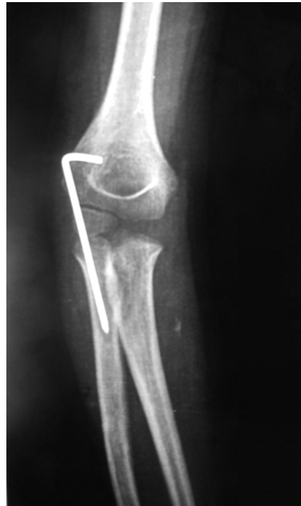
Fig. 4b: Post-operative Anteroposterior view radiograph.

reduction should be performed right away, as attempts at closed reduction will only serve to increase chondral damage or neural damage. As surgical repair of the dislocation is delayed, a more extensive surgical procedure is likely to be necessary to achieve a successful result.