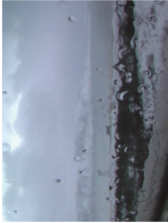
Weather and glass. Arctic landscapes (Fieldwork film, Weather Permitting, Gabrys and Yussoff)