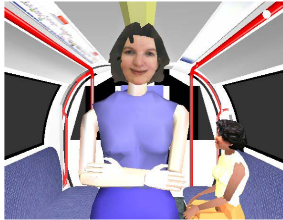
Figure 2: An example character

Thus we come to the central hypothesis of this paper: correlational NVC is a key determining factor for presence during social interaction with virtual characters, or mediated via avatars. The remainder of this paper describes current work in progress to test this hypothesis, and in particular to create characters that display correlational NVC. Our characters have been created to