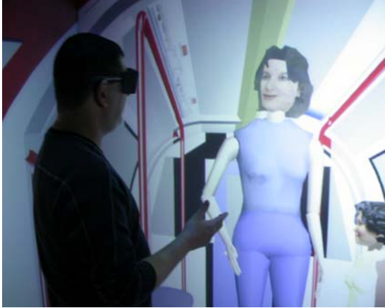
Figure 3: Social Interaction between a real and virtual human