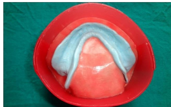
Figure 4. Boxed impression ready to pour