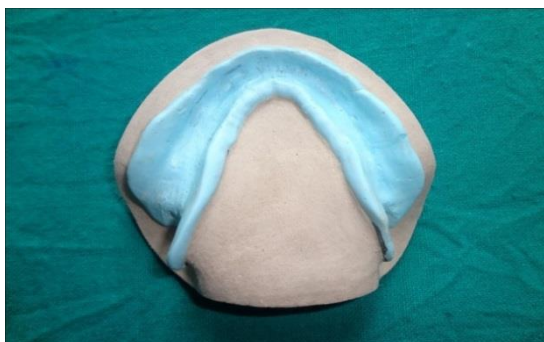
Figure 2. Trimmed plaster & pumice beading around an impression