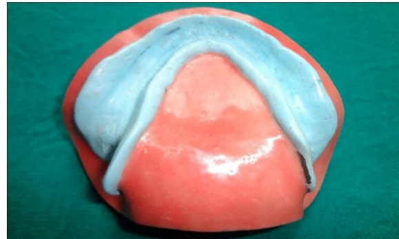
Figure 3. Modeling wax layering over plaster pumice beading around an impression & tongue space