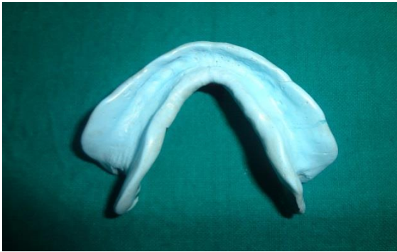
Figure 1. Final mandibular impression