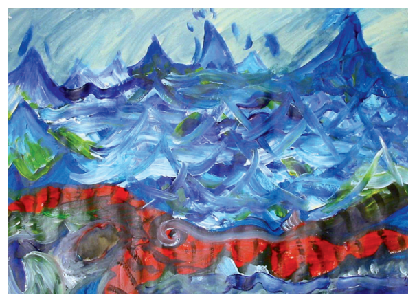
Cover painting: ©Sharon Rogers 2007