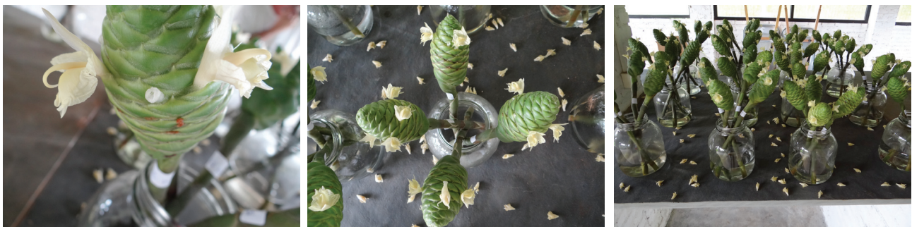
Figure 2. Flowers opening in bracts and falling down from inflorescence of Zingiber zerumbet flower stem.

(31.81 VLD) in contrast the stems submitted to the treatment full sun area + BSI presented a lower longevity (22.94 VLD). The treatments partial shade conditions + BSI (27.88 VLD) and full sun area + CFI (28.19) did not differ from each other.