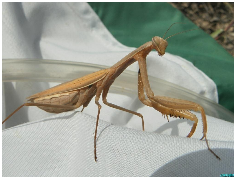
Fig. 2. Praying mantis or European mantis ( Mantis religiosa ) adult female in Zalău-Ortelec, loc. 267.

Our praying mantis records are from Munții Plopiș (1 data), Culoarul Someșului (3), Dealurile Crasnei (2), Munții Meseșului (7), Depresiunea Almaș-Agrij (2) and Dealurile Sălajului (2). These suggest that the species is widely distributed in the region. (Fig. 1.)