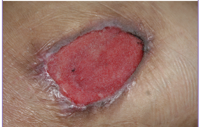
Fig. 4. Postoperative view (4 months later)

With antibiotics and negative pressure dressing therapy, infection and inflammation was controlled well and the ulcerative lesion was filled with healthy granulation.