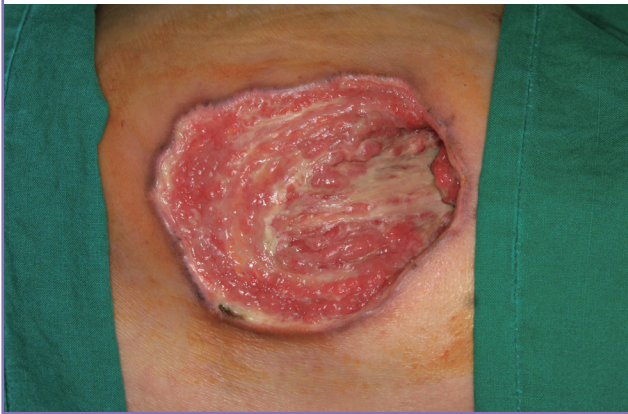
Fig. 2. After the fourth negative pressure dressing therapy

Necrotic ulceration measuring 6×9 cm was found and a pocket formation 6 cm deep was observed.