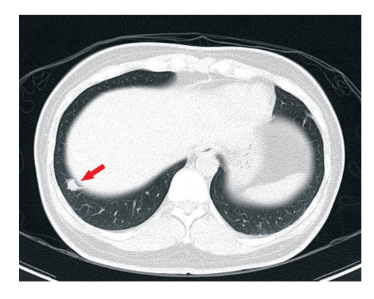
Fig. 2. Computed tomographic images of the lungs. Three years after surgery, multiple pulmonary nodules (red arrow) were noted by CT.

Histopathologic findings of the right thigh mass. (A) The junction between the dermatofibrosarcoma protuberans (DFSP) and the fibrosarcomatous component is indicated by black arrows. The area on the lower left with lower cellularity is the DFSP portion and the upper right area with higher cellularity is the fibrosarcomatous dermatofibrosarcoma (FS-DFSP) portion (H&E, \times 100). (B) DFSP shows strong immunoreactivity in the lower left of the photomicrograph, and the FS-DFSP region shows weak immunoreactivity in the upper right. The boundary between DFSP and FS-DFSP is indicated by black arrows (CD34, \times 100).