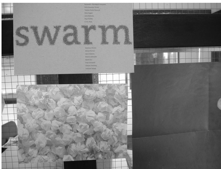
Special Collection office view.

The WAL/Make flourished with the help of several generations of women, all equally impassioned and committed to supporting women's artwork on feminist terms. And yet the generational differences were acutely felt within the organisation, where separate feminist cultures emerged and played out in the two activities of publishing a topical magazine and running an artists' membership. The very term 'feminist' swung from