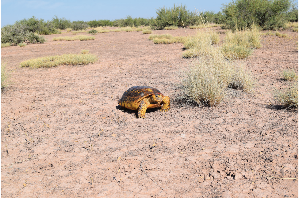
Figure 1. Gopherus flavomarginatus and halophytic grassland Hilaria mutica .

(Gavilán 2008). Given this situation, endemic or native species are the most vulnerable (Contreras-Balderas et al. 2003). Gopherus flavomarginatus is an endemic tortoise species of the Bolson of Mapimí zone of the Chihuahuan Desert in the north-central México (Figure 1). The Bolson tortoise is considered vulnerable by IUCN Red List (2017). This species inhabits halophytic grasslands of Hilaria mutica on which it feeds, presenting an apparently mandatory association (Aguirre et al. 1979). Therefore, there exists a close interaction between the presence of the grassland and that of the tortoise.