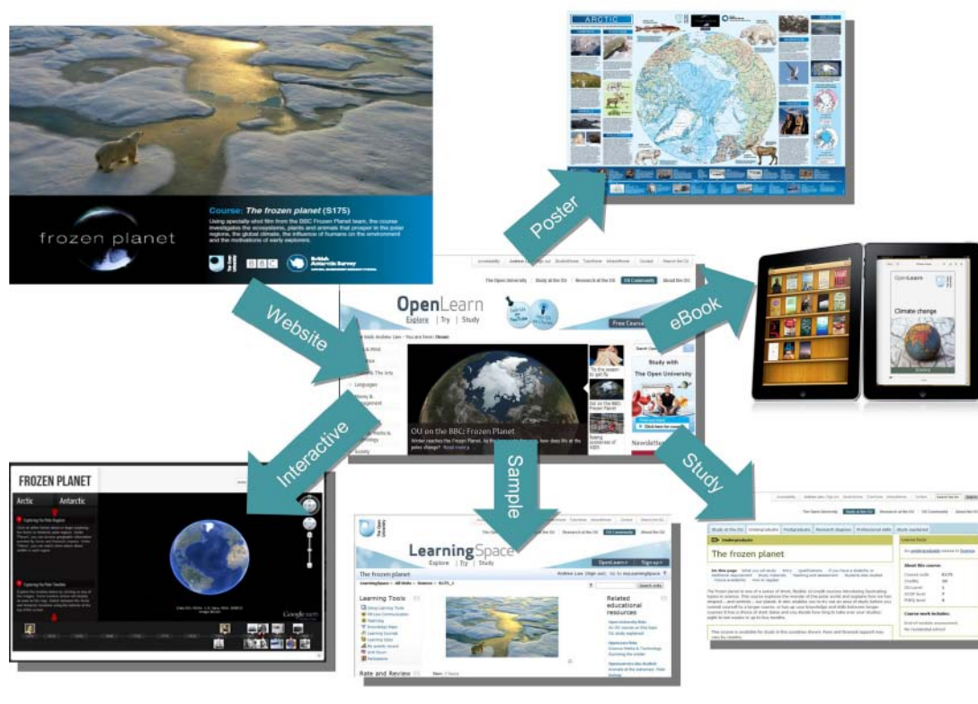
Figure 2: Frozen Planet : an example of the interrelated items of open engagement around a single open media campaign starting with the TV programmes

The level and sometimes depth of public engagement in just this one campaign around Frozen Planet is evident in that by March 2012 44% of the adult viewing population in the UK had watched at least one episode, 200,000 people requested the poster, 300,000 looked at the related materials on OpenLearn, 60,000 used the interactive item and 600 have gone on to register for the related module.