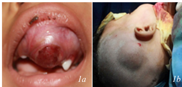
Figure 1 : Intraoral swelling (a) with focal ulceration along with postauricular swelling (b)