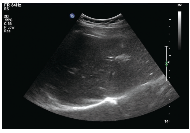
Figure 1. Abdominal ultrasonograph showing a prominent periportal interstitial echogenicity, suggesting hepatitis.