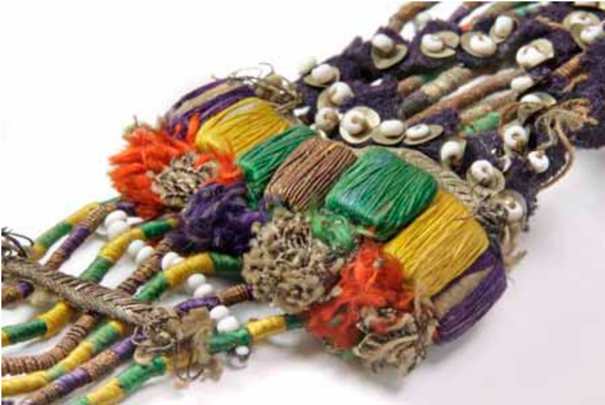
Braid from the former Yugoslavia. Ethel Mairet source collection, Crafts Study Centre 2004.202.37