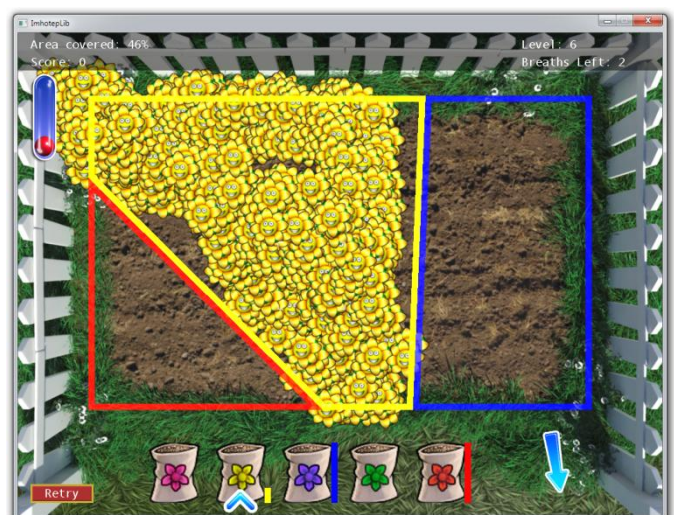
Figure 3: "Flower" game screenshot

The top right side of the screen contains the same information as for the previous game. This is the number of lives and breaths remaining before the game is over. Figure 3 shows a screenshot of a game in progress.