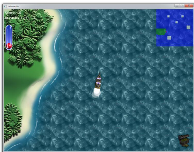
Figure 4: "Pirates" game screenshot

The game moves to the next level when all treasure items have been collected from the map. The level of difficulty as well as the amount of treasure increases with every new level. Difficulty increases in three ways. Additional pirate ships, water whirlpools and land obstacles that the player has to navigate through. Reward increases through more treasure available to collect.