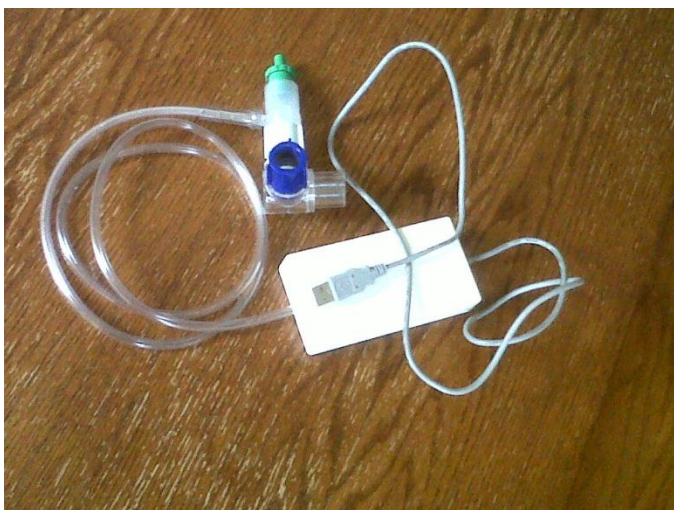
Figure 1: Version 2 of our breath controller

PEP devices are available from medical suppliers and are supplied free of charge on the NHS to CF patients who are asked to undertake their physiotherapy via PEP. The PEP device, like the PC, is non-proprietary. The innovation we have developed is the connector and the games that can be controlled through air pressure.