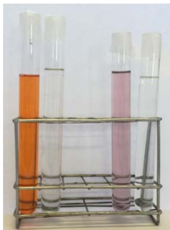
Figure 5. Effluents before and after the ECUVal system

Currently, the validation of the pilot at industrial scale is being carried out. The first tests have shown that the ECUVal system enables to discolour the mill effluents (Figure 5) and these decoloured effluents that can be reused in new dyeing processes, with both monochromies and trichromies. The viability of the ECUVal system and the potential consumers has been evaluated by means of a business plan study.