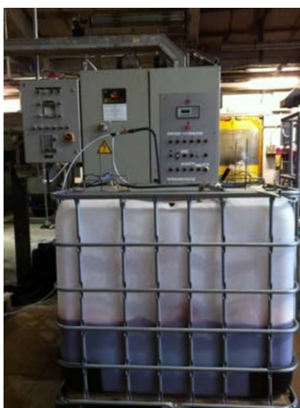
Figure 3. Semi-industrial system

On the basis of previous results obtained by the research group at laboratory scale, a semi-industrial 0.4m 3 prototype was built and validated in a Spanish mill (Figure 3).