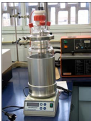
Figure 2. Electrochemical cell used at lab scale

Effluents from the Jet dyeing process were selected for this study. First of all, the effluents were treated at laboratory scale in a 0.5L electrochemical cell with a single compartment. In all cases, the intensity was set at 10A. The electrodes used had an active surface of 45 cm 2 (Figure 2).