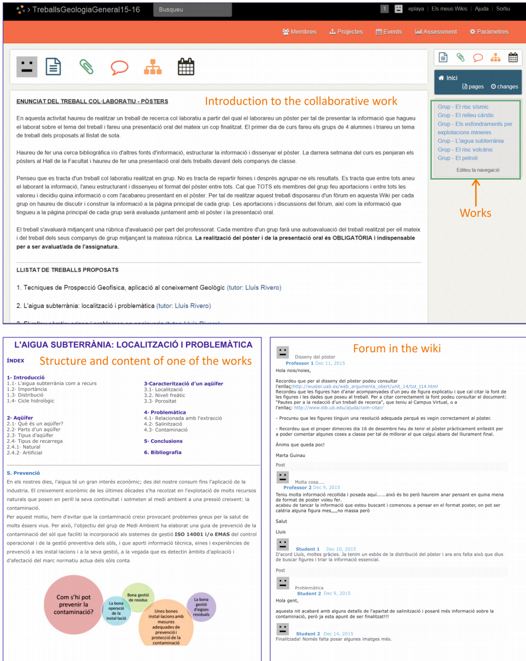
Figure 1. Example of the wiki created in www.wikispaces.com , with a main page (image above) where the collaborative work is introduced. The menu on the right bank contains the links to access to the pages of each work. The bottom left image presents an example of the structure and content of one of the works. The bottom right image shows the forum of the wiki with some messages of the students and the lecturer.