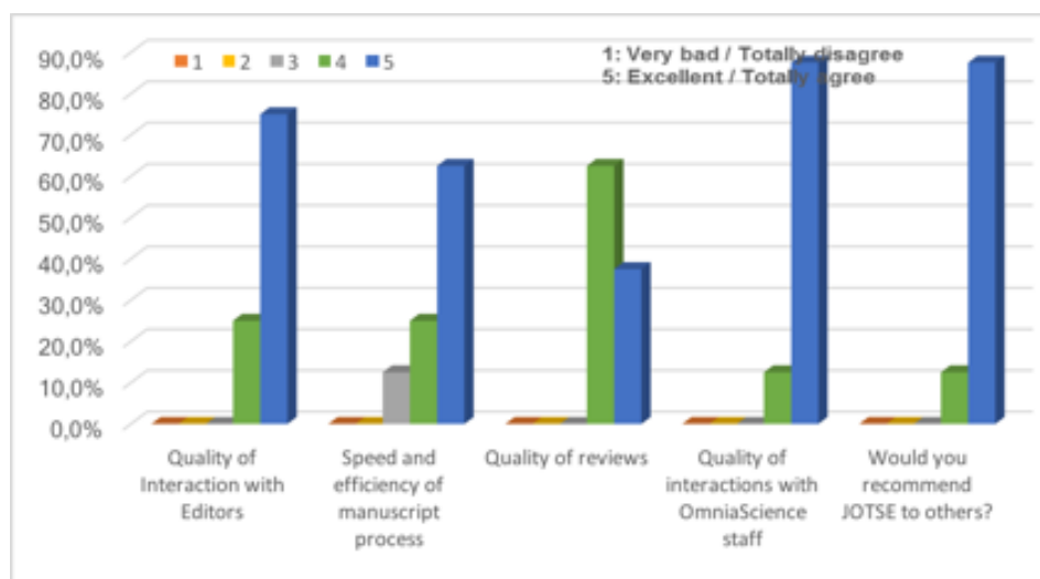
Figure 2. JOTSE author survey results 2016

For this 2017 we are foreseeing new challenges, such as the increase in the number of submitted articles as well as making an extra effort to keep our reviewers' fidelity. As we can see in the Figure 2, We can improve on our quality of review, if our reviewers feel more involved with JOTSE and we will work this year for that.