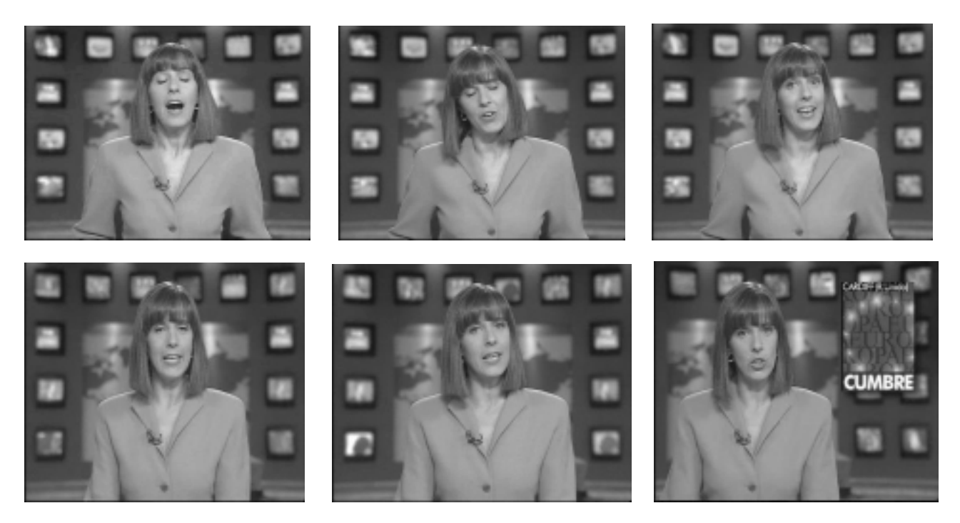
Figure 3. Recognized test images (CIF)