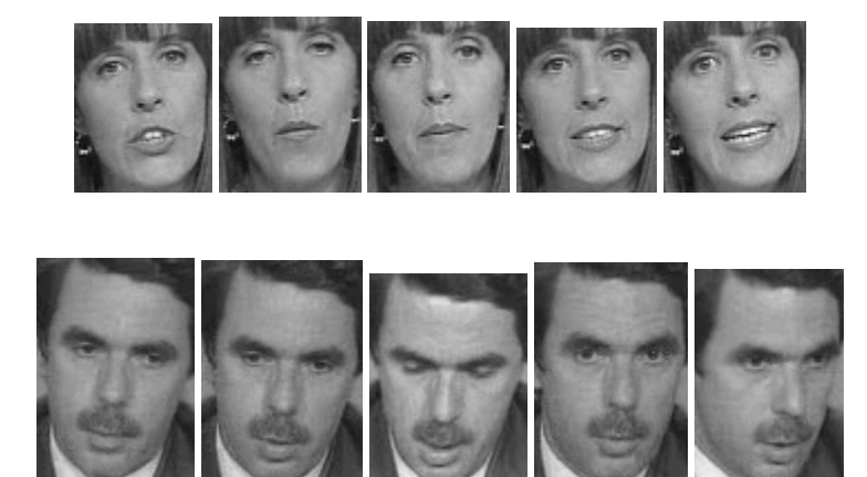
Figure 2. Original training images (real size)