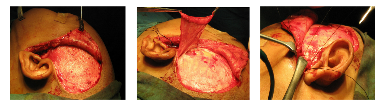
Figure 4. Interposition temporalis superficial fascia flap procedure. A. Incision design. B. The temporalis superficial fascia flap. C. Interposition of the fascia between the bony segments