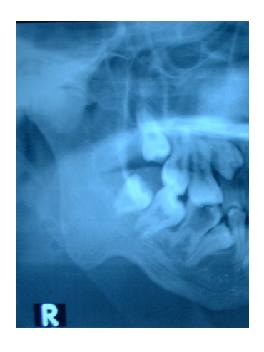
Figure 3. Panoramic radiography showed bilateral TMJ ankylosis (arrow).

Sadikin Hospital, Bandung, West Java, Indonesia with chief complain could not open his mouth widely started at the age of 13 due to sport injury. He had also a history of multiple bone fractures i.e. bilateral humerus and left tibia that have already been corrected by orthopedic surgeons. A TMJ injury might not be detected at that time. Oral examination revealed poor oral hygiene,