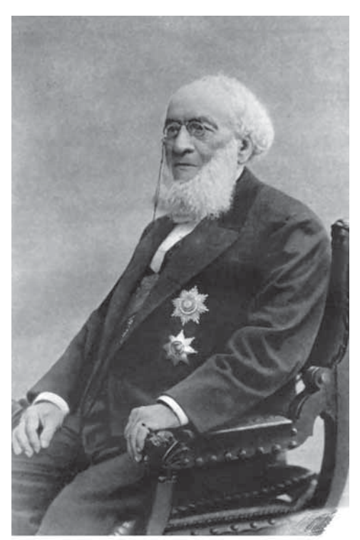
Петр Петрович Семенов Тян-Шанский 1827—1914