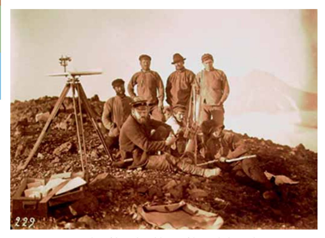
Fig. 8. Members of the Geological division of the Kamchatka expedition.

botanical (led by V.L. Komarov), zoological, hydrological, and ethnographic.