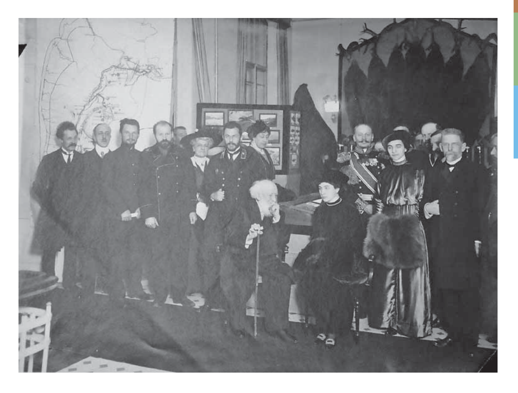
Fig. 10. Participants of the exhibition devoted to the Kamchatka expedition in December 1912.

seasons from 1908 to 1910. Additionally to the field studies, the Meteorological division organized five permanent weather stations in the city of Petropavlovsk and the villages Kluchi, Mil'kovo, Tigil and Bolsheretsk. The efforts of the Botanical division were summarized in the monumental three-volume work of V.A. Komarov "Flora of Kamchatka". The activities of the Zoological and Hydrological divisions were presented at the meetings of the Geographical Society and were published in its reports. The data gathered by the Ethnographic division were published later in books about Itelmens and Koryak people.