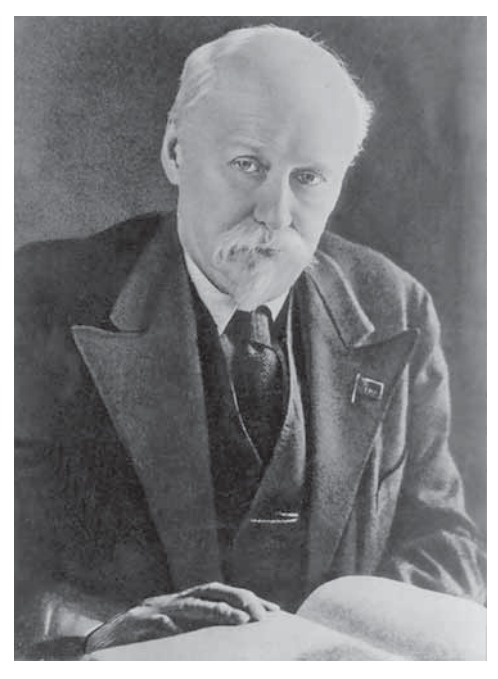
Fig. 7. Vladimir Leontievich Komarov.