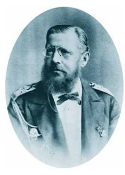
Fig. 3. Grand Duke Constantine – the first Chairman of the Russian Geographical Society.