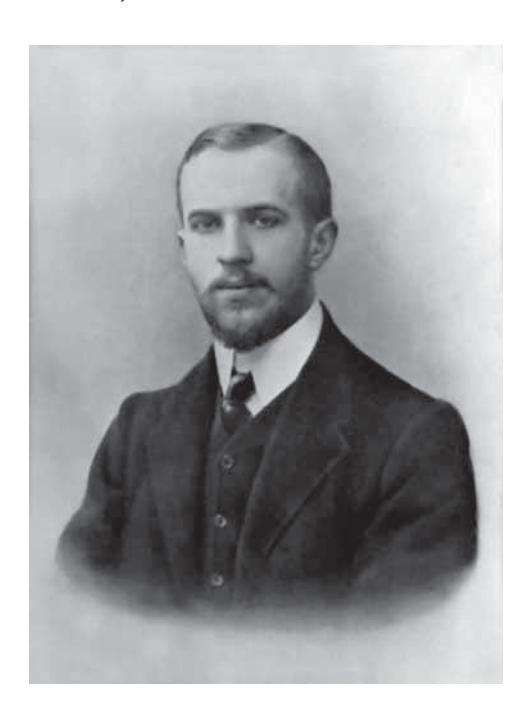
Fig. 6. Fedor Pavlovich Riabushinsky.

The Head of the expedition was a botanist Vladimir Leontievich Komarov (1869–1945), the future President of the USSR Academy of Sciences (Fig. 7). The expedition consisted of six separate divisions: geological, meteorological,