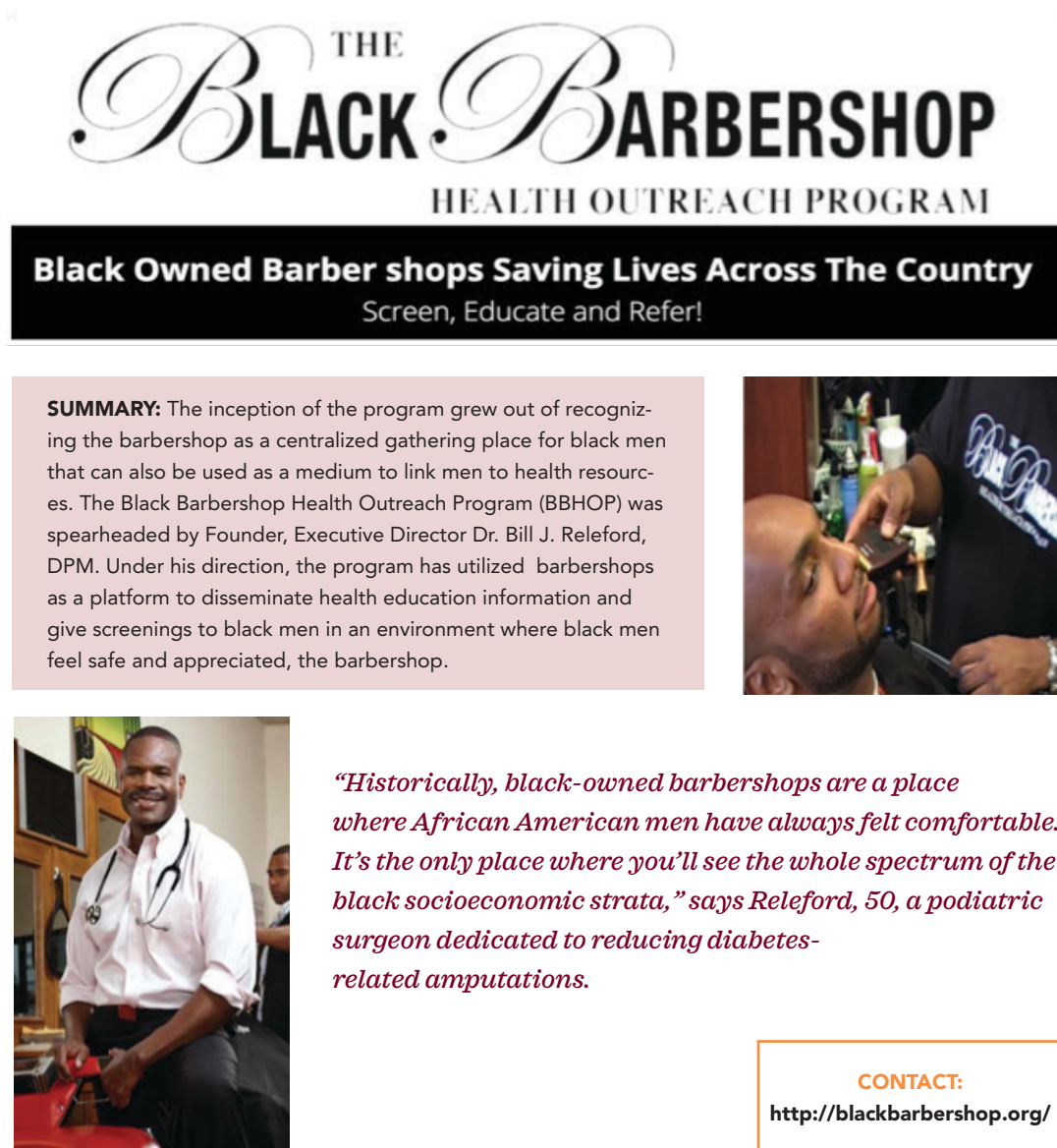
FIGURE 7 PROPOSED AND ACTIVE PROGRAMS THAT ADDRESS BLACK MEN’S PHYSICAL HEALTH

Our final group of grey literature sources under the physical health interventions section includes community and clinically oriented chronic illness and prevention programs for black men. While few in number, these programs were tailored and designed for adult-aged black men, and a majority of the programs are in community-based settings (see Figure 7).