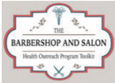
FIGURE 6 BLACK MALE-SPECIFIC PHYSICAL HEALTH RESOURCE MATERIALS

Our third section of grey literature includes frameworks and conceptual tools for the prevention and treatment of chronic illness in black men. These resources were comprised of toolkits that included information regarding how to train and further build infrastructure in organizations and communities, along with helpful resources that can be used directly with black men (see Figure 6).