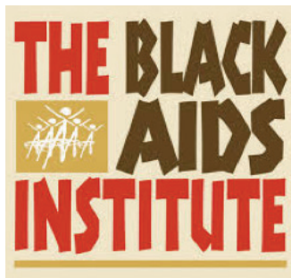
FIGURE 5 BLACK MALE-SPECIFIC PHYSICAL HEALTH RESOURCE MATERIALS

The second section of grey literature consists of programs and initiatives focused on capacity building for preventing and treating chronic illness in black communities. These resources provide different types of activities that are designed to improve and enhance the ability of communities to develop and sustain chronic illness prevention or treatment programs over time. A majority of these programs and initiatives were directly provided by private, state, and federal entities. Some focused on black men specifically, while others targeted both men and women, but have significant implications for men (see Figure 5).