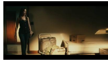
Picture 1.6 1.26.11-1.27.06 Sara moves to another dorm