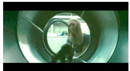
Picture 7.3 44.19-44.33 Rebecca is trying to kill cuddle