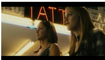
Picture 1.1 1.09.11-1.10.07 Rebecca & Sara at tatoos shop

Rebecca’s behavior is getting worse. She makes many conflicts with people around Sara. An awful thing she does to Sara is Rebecca making a tattoo with Sara’s sister name. Another two-shot as in picture 1.1 & picture 1.2 displaying Sara and Rebecca at tatoos shop to make Rebecca’s tatoos. Close up shot in picture 1.3 shows Sara finds a sketchbook with Sara’s face on it. It makes Sara uncomfortable and she fears of Rebecca’s behavior.