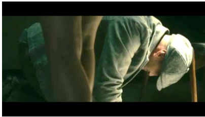
Picture 7.4 50.16-51.21 Rebecca kicks professor

reasons is Cuddle. Once again, the Ego of Rebecca comes up to fulfill her Id 's desire to keep Sara with her. In order to make Sara stays in the dorm, she kills Cuddle .In order to satisfy her desire, she throws the entire obstacles that prevent her friendship with Sara even to an innocent little cat.