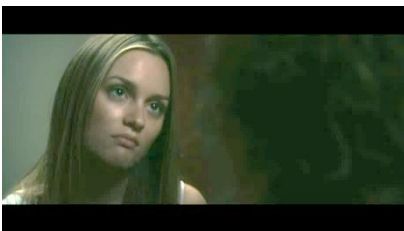
Picture 7.1 25.22-25.27 Rebecca is intimidating Tracy