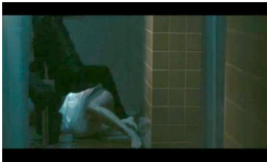
Picture 6.4 31.52-32.14 Rebecca attacks Irene

and it disturbs Rebecca as well. Two-shot in picture 6.5 shows Rebecca is flirting to the professor but then she intimidates the professor. The fourth person is Steven who is Sara's boyfriend. Rebecca argues with Steven because Sara moves to Steven's room. Rebecca rudely asks Steven about the reason of Sara moves from the dorm. Medium shot in picture 6.6 shows Steven is responding Rebecca's question. At first, Steven looks calm but he cannot handle it anymore and says, "She moves, because of shits you do!"