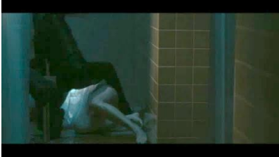
Picture 5.1 31.52-32.14 Rebecca is Intimidating Tracy

that Sara betrays their friendship because Sara chooses to move from the dorm after Sara knows that Rebecca has a psychological problem. From the explanation above, it can be seen that Rebecca cannot control her emotions. It indicates vengefulness.