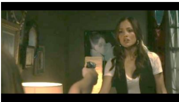
Picture 1.4 1.15.45- 1.16.00 Sara is threaten by Rebecca

Rebecca's back because Rebecca strangles Sara's neck. It happens because Rebecca takes revenge and forces Sara to conciliate with her. Rebecca also intimidates Irene by tying her body on the bed. Rebecca and Sara also fight in the room. It is depicted with full shot in picture 1.6, Sara decides to move to another dormitory and never meet Rebecca anymore