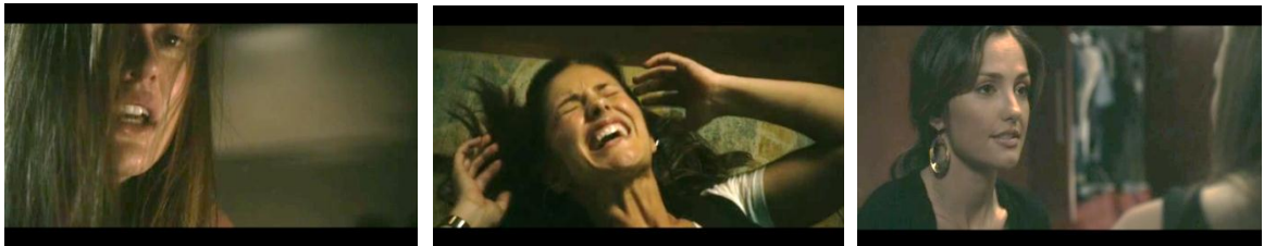
Picture 6.1 1.20.43-1.21.10 Picture 6.2 1.22.45-1.23.00 Picture 6.3 43.32-44.01 Rebecca apologize to Sara Sara fall after hit by Rebecca Sara argues with Rebecca

struggling with herself, she really likes Sara but she also feels betrayed. It reveals when she accidentally hits Sara then she apologizes first because of feeling guilty. Rebecca expresses her anger by shouting and hitting Sara but suddenly she lowers her voice and rubs Sara's head in gentle because she likes Sara. The sense of liking and betrayal rages within her. In which it emerges two opposing forces in a plot within her/his own nature (man against himself).