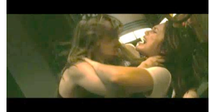
Picture 5.3 01.24.01-01.24.26 Rebecca is trying to kill Sara

In conclusion, the character Rebecca in The Roommate film has characteristics such as obsessive action, manipulative, perfectionism, and vengefulness. From the complex behavior and characteristics of Rebecca in this film, it can be said that Rebecca has a round character. It shows how she is always changing character in every storyline.