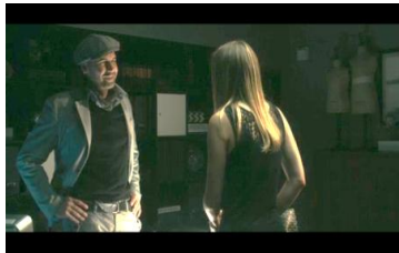
Picture 6.5 49.19-51.20 Rebecca meets the professor