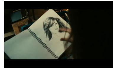
Picture2.3 1.11.55 - 1.12.10 Sketch of Sara's Face

Rebecca gets anxious about her friendship with Sara in which many obstacles come to Rebecca. People try to get close with Sara and to steal Sara's interest. Even more, she tries to kick out all of those obstacles. Picture 3.1 uses close-up shot shows Rebecca is crying and creating a line story about the accident of Cuddle. In order to prevent Sara to move to Irene's house, she creates a fake story about Cuddle. She kills cuddle by putting him into a washing machine and burns him. Two-shot in picture 3.2 & picture 3.3 shows that Rebecca lies on the bed and looks in pain. In order to catch Sara's attention, creating another fake story that she is attacked by a gangster. It is indicating manipulative action.