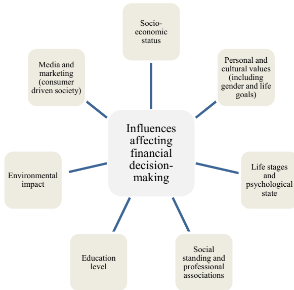
Fig. 2 Possible influences on financial decision-making

application) of financial literacy (see Fig. 1) depend on the circumstance of each and every individual. As an example, an individual with a concern for the socioeconomic status of the participants attending a school fundraiser would consider the impact of the price set for each item available for sale. Moreover, being concerned about how others may be impacted by the price set for each item is the compassionate focus to financial decision-making that moves beyond the wealth accumulation focus of conventional approaches to financial literacy education. Teaching financial literacy in a mathematics classroom, therefore, is not just about achieving the highest profit and/or the largest sum of money saved/invested ; it also involves a social and ethical element. Boylan (2016) argues that ‘relationship[s], practice and action [are] sites for ethical reflection’ (p. 400), and this may include the relationships formed both inside and outside the classroom, education practices and action/approaches advocated for in the classroom. Taking these considerations into account, the research question guiding this study is: What classroom practices may enable critically compassionate approaches to financial decision-making?