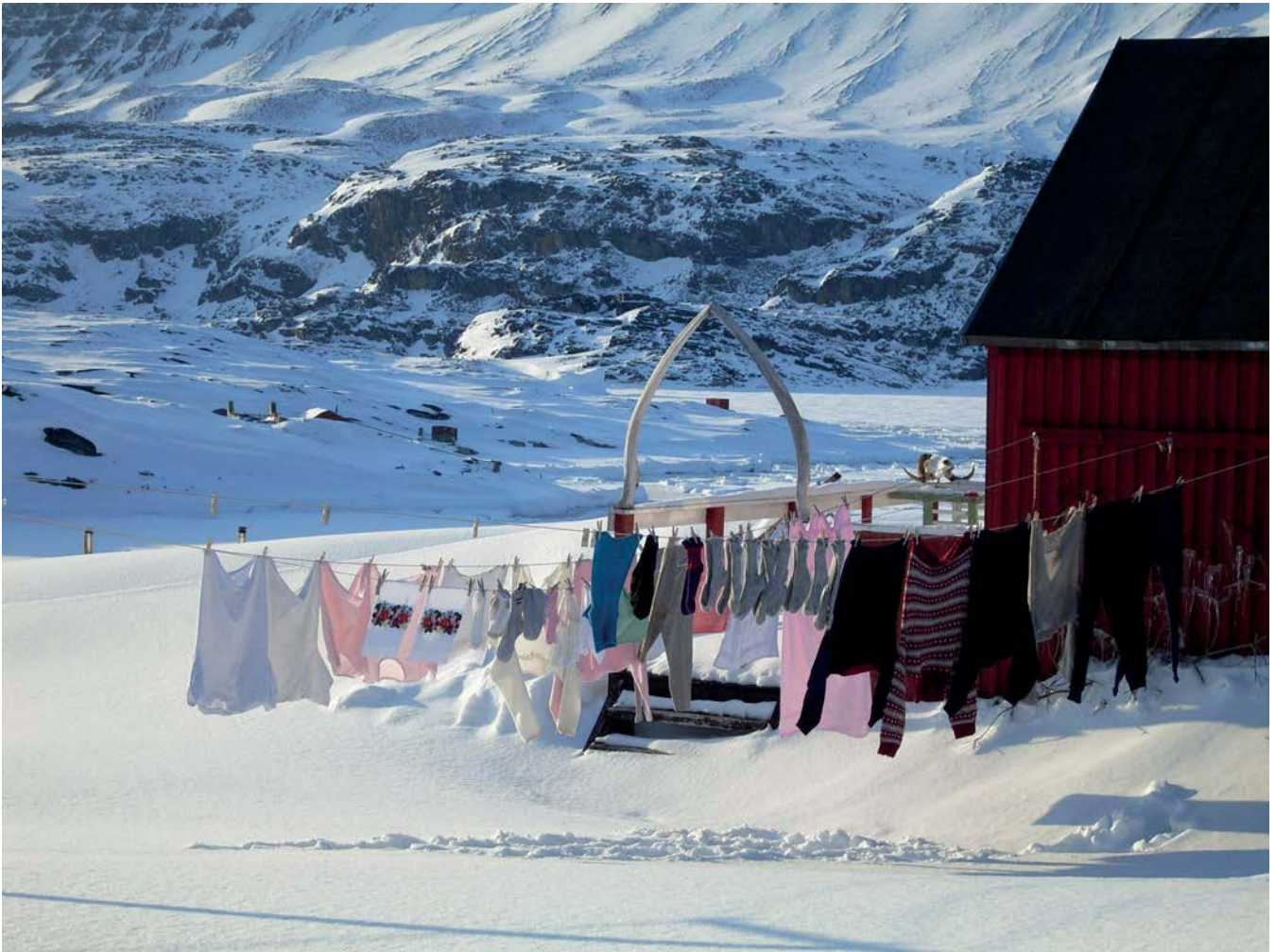
Photo: Greenland.

Therefore, while the overall contribution of these species to the Greenland economy appears to have decreased, the contribution to the individual hunter's household does not appear to have decreased, at least not on average. However, individual households' reliance on hunting as a share of total household income (subsistence and cash) and the distribution of hunting incomes across households are not known and may change dramatically in the future as a result of predicted climate changes and further tightening of hunting regulations aiming to protect vulnerable species.