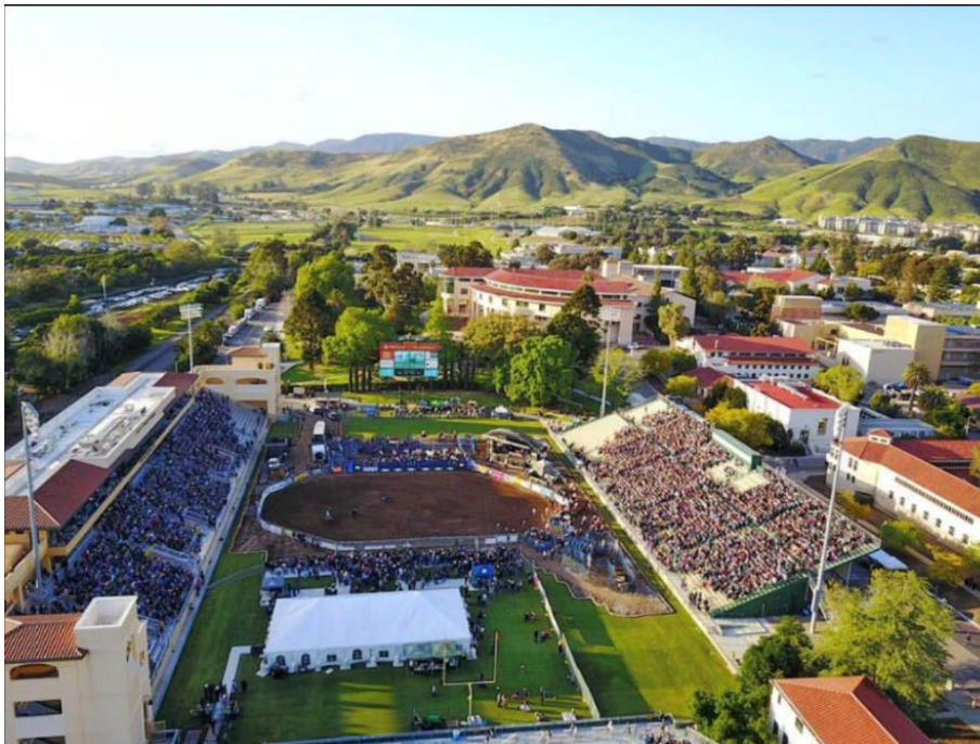
Figure 5: Aerial Photo of Saturday Performance.

Not only did this project pave the way for the Cal Poly Rodeo Team as a premiere program in the country, but for the University as a whole embodying the “Learn By Doing” philosophy. Other colleges, sporting venues, and committees can look at this example of what we did to produce an event of their own. The university, community, and outside professionals came together as one body in working on this project. For this concept to spread externally makes this project a success in more ways than completing a task, it creates an environment of cohesion.