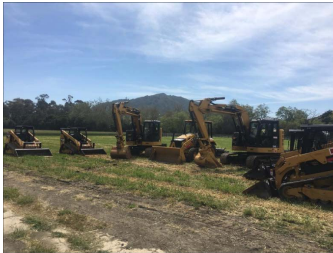
Figure 1: The CAT equipment used for the project

Logistics are everything. This is where a bulk of the time was spent in filling out paperwork, organizing specs, ironing out details, and maintaining communication between several people. With the construction process we needed to define the process of covering a live grass field, the specs of what dirt we needed, the equipment necessary and feasible to use with the location and regulations in place, a timeline of construction, manage/mitigate foreseeable issues, acquire traffic control, and determine manpower of installation. Of course further issues arise as each component is worked on; details become important in some areas and minimized in others. For instance, feeding the truck drivers and labor crew became very important in the middle of the night, but the exact cycle time of trucks wasn't as necessary to have pinpointed; we knew how many trucks we could possibly use and let them run.