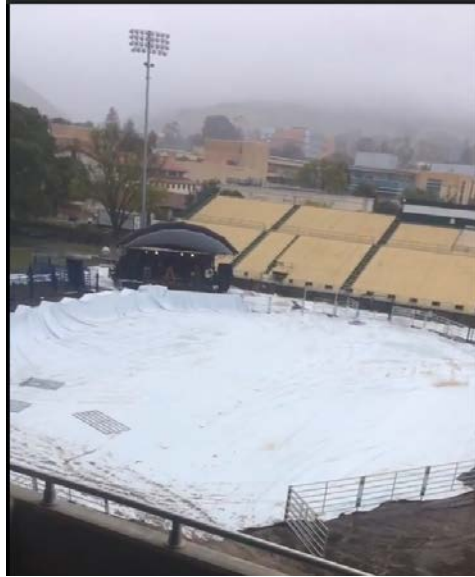
Figure 3: Arena Tarped for Friday Rain

Other new knowledge I was exposed to regarded learning to manage people. This is a soft skill I believe to be innate or absent; some are natural, others struggle to become efficient. With this project, several different types of people are involved and each has their own input. Learning to listen yet take things with a grain of salt is necessary to stay focused and confident, while also being willing to incorporate any useful information others provide. Everyone has their strengths, pushing them to excel in their specific areas is a very useful tactic in managing a project.