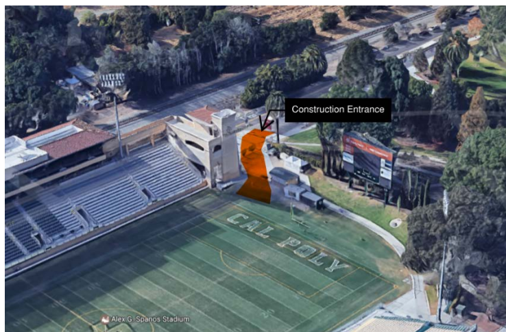
Figure 2: The entrance for all construction equipment and materials

With the transformation of Spanos being the first run at a production like this, even in many regards for veterans like Randy who do this work for a living, many of the choices made were a best guess. Without benchmarks to go off, only so much knowledge can be acquired in ultimately making a decision. The important aspect of this is accepting that things may go differently and having a plan for several outcomes. The whole idea is to manage difficulties, the more pre-designed ideas of solutions, the less you are caught off guard and the better you can focus efforts on unforeseen obstacles.