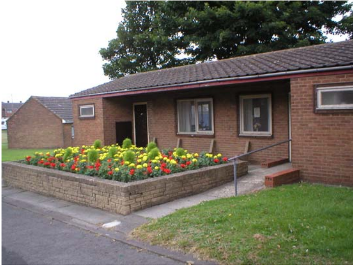
Figure 8: Photograph of a flower bed: A place of enjoyment for participants