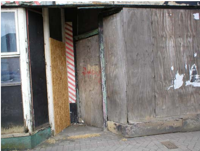
Figure 7: Photograph of boarded-up shop fronts: A place of fear and discomfort for participants

A small group of participants were given a digital camera and asked to take photographs in the village of places and objects, which were important to them. Participants returned with a good number of pictures, explaining their reasons for taking particular shots. Participants tended initially to focus on negative images (figure 7) (probably also because they were not residents of that particular village), but then became themselves aware of their bias and took some positive pictures as well (figure 8). Of the three women who were in the group one took all of the pictures, although the others had some input into which places to photograph. An awareness of group dynamics, in particular dominant individuals is necessary. Not all participants were confident about taking the photographs. They nonetheless had an influence on the objects chosen for photography. Participants greatly enjoyed taking photographs and discussing them with the group.