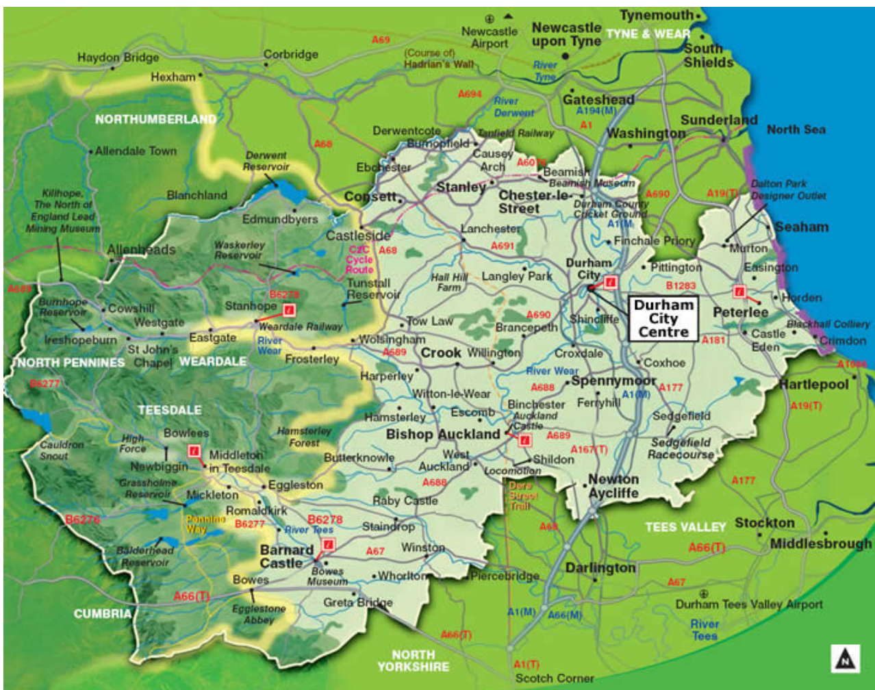
Figure 2: County Durham in the Northeast of England ( http://www.visitcountydurham.com/site/attractions-map )

For Weardale the locations were: Stanhope, Wolsingham, Rookhope, St. John’s Chapel, Witton-le-Wear. For Teesdale the locations were: Gainford, Barnard Castle, Woodland, Copley, Middleton-in-Teesdale. And for Derwentside the locations were: Consett, Delves Lane, Lanchester, Moorside and Tantobie. Of those locations Barnard Castle and Consett are towns, the rest are villages with varying facilities and varying distances to the nearest town (from 2 miles to 28 miles).