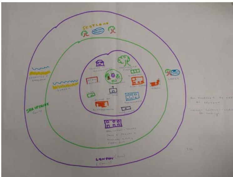
Figure 11: Mobility diagram

In order to aid individuals' recall of past travels and destinations participants were instructed to think back over the last two weeks for regular travels, or for less frequent journeys to go back in time no more than one year. In fact, many of the groups where participants were familiar they reminded each other of journeys they had made. Discussion of various destinations amongst participants whilst drawing also helped to jog others' memories of their own journeys. In this way recall errors or omissions were minimised. The diagrams were useful in developing participants'