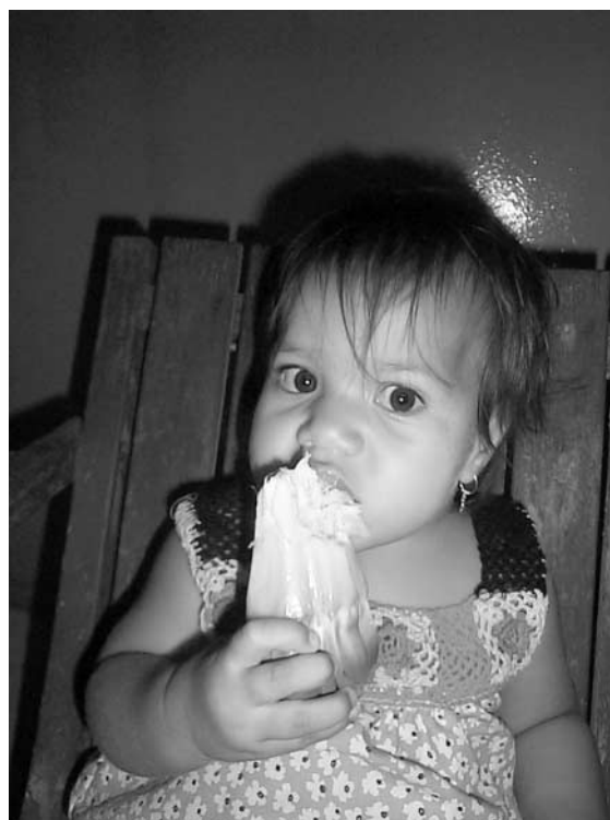
Fig. 2 Young child chewing and sucking on a pandanus key for its sweet pulp

cultivars 28–30 show that the carotenoid content varies greatly among cultivars, with the greater carotenoid content found in those cultivars with the deepest coloration. The provitamin A carotenoids include \beta -carotene (the carotenoid making the greatest contribution to vitamin A activity), \alpha -carotene and \beta -cryptoxanthin 1 . Epidemiological studies show that the consumption of foods rich in other carotenoids, such as lutein, zeaxanthin and lycopene, protects against certain chronic diseases such as heart disease, certain cancers, diabetes and age-related macular degeneration 31–34 , indicating that consuming these carotenoid-rich foods may have multiple health benefits.