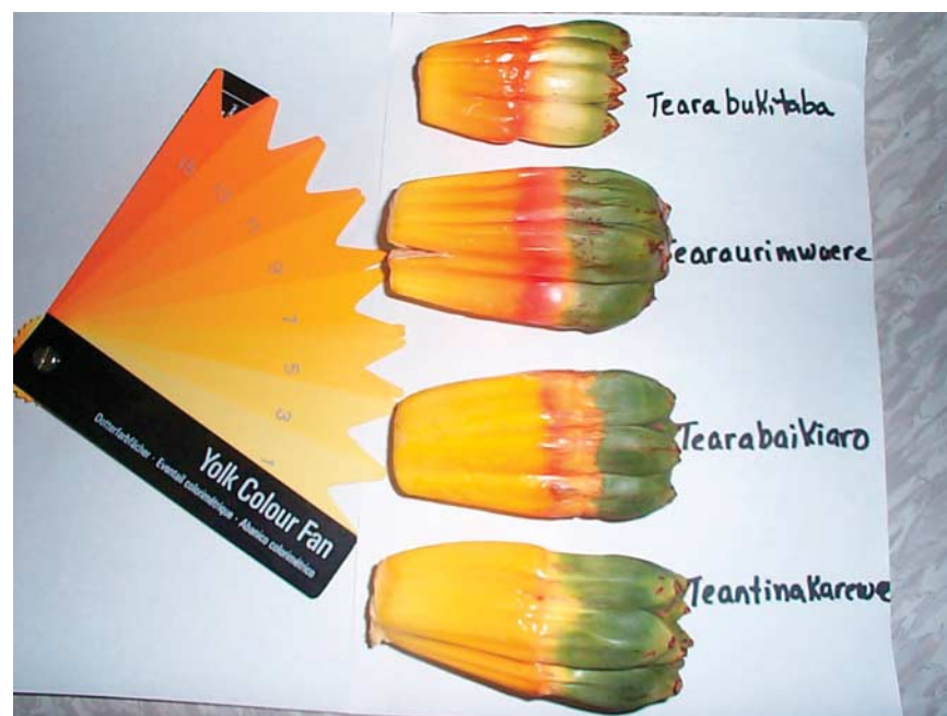
Fig. 4 Comparison of four pandanus cultivars with the DSM Yolk Colour Fan, with the Tearabukitaba cultivar showing with the greatest coloration

In general the deeper coloured pandanus cultivars and other foods with deeper coloured edible portions had