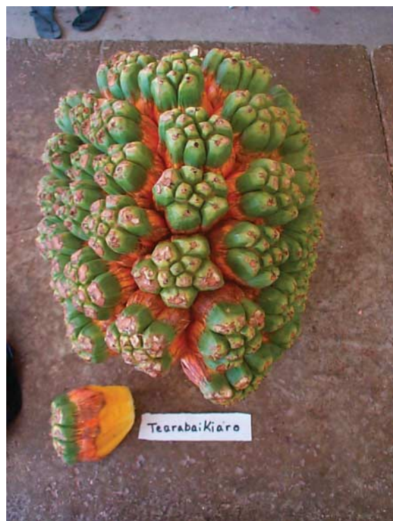
Fig. 1 A ripe pandanus bunch, Tearabai Kiaro cultivar, and one key, showing the outer green inedible portion and the orange-yellow coloration of the edible portion