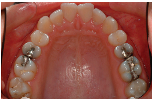
Figure 1 The initial malocclusion with a palatally displaced right lateral incisor.

Three different bracket types were evaluated: Incognito™ lingual brackets (3M Unitek, Monrovia, Minnesota, USA), STb™ lingual brackets (Light Lingual System, ORMCO), and conventional stainless steel 0.018 inch slot brackets (Gemini, 3M Unitek). Polyvinylsiloxane impressions of the initial malocclusion with a palatally displaced right lateral incisor (Figure 1) were sent to certified laboratories in order to construct the transfer trays for the indirect bonding of the lingual brackets (Incognito Laboratory, Bad Essen, Germany and AOA Orthodontic Laboratory, Sturtevant, Wisconsin, USA). Additionally, three identical maxillary models of the initial malocclusion were constructed from acrylic resin. Each model was bonded with brackets up to the first/second premolars from each bracket type. Both lingual bracket types had a 0.018 inch slot. The Incognito brackets had a vertical slot at the anterior region (Wiechmann et al. , 2003), in contrast with the STb brackets, whose slots were horizontal. The latter bracket system had 0 degree angulation, high torque at the anterior region (+55 degrees), and standard torque (+11 degrees) at the premolars. The conventional brackets were bonded on the centre of each tooth mesio-distally and at the suggested height with the aid of a Unitek bracket positioning gauge (3M Unitek). The specifications of the conventional brackets were the following: upper central incisor torque 0 degree and