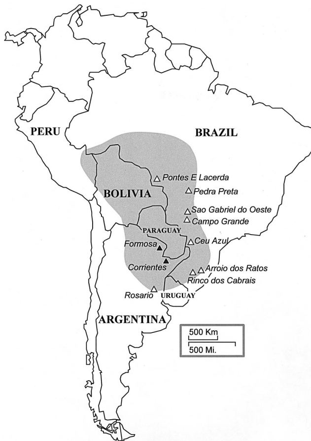
Fig. 1. Locations of populations of native S. invicta from which specimens were collected for determination of social form. White triangles indicate locations of samples for the current study; black triangles indicate locations of samples from the studies of Ross (1997) and Ross et al. (1997). Extent of the native range, indicated by shading, is based on Buren et al. (1974), Trager (1991), and Pitts (2002).

not the B allele sequence. For our study, this diagnostic PCR assay incorporated two forward primers, one fully complementary to the b allele and the other fully complementary to the b' allele, and a single reverse primer fully complementary to all three alleles (see Table 2 for primers). PCR reactions were set up in 20- \mu l reaction mixtures containing 1.6 \times PCR buffer (16 mM Tris-HCl, 2.4 mM MgCl 2 , 80 mM KCl), 1 \times Q-Solution (Qiagen), 100 \mu M dNTP, 0.167 \mu M of primer Gp9_b_for , 0.333 \mu M of primer Gp9_b_prime_for , 0.5 \mu M of primer Gp9_all_rev , 2 \mu l of hydrated template DNA, and 1.0 U of Taq DNA polymerase. PCR reactions were conducted in 0.5-ml thin-wall PCR tubes under a mineral oil barrier. The following cycling profile was employed: initial denaturation at 92°C (2 min); 35 cycles of 92°C (45 s), 57°C (45 s), and 72°C (1 min); and a final elongation step at 72°C (5 min). The predicted 219-bp PCR product in individuals bearing a b -like allele was visualized under ultraviolet light in a 2% agarose gel stained with ethidium bromide. Preliminary experiments using varying concentrations of template DNA from 14 individuals of known genotype confirmed that the assay