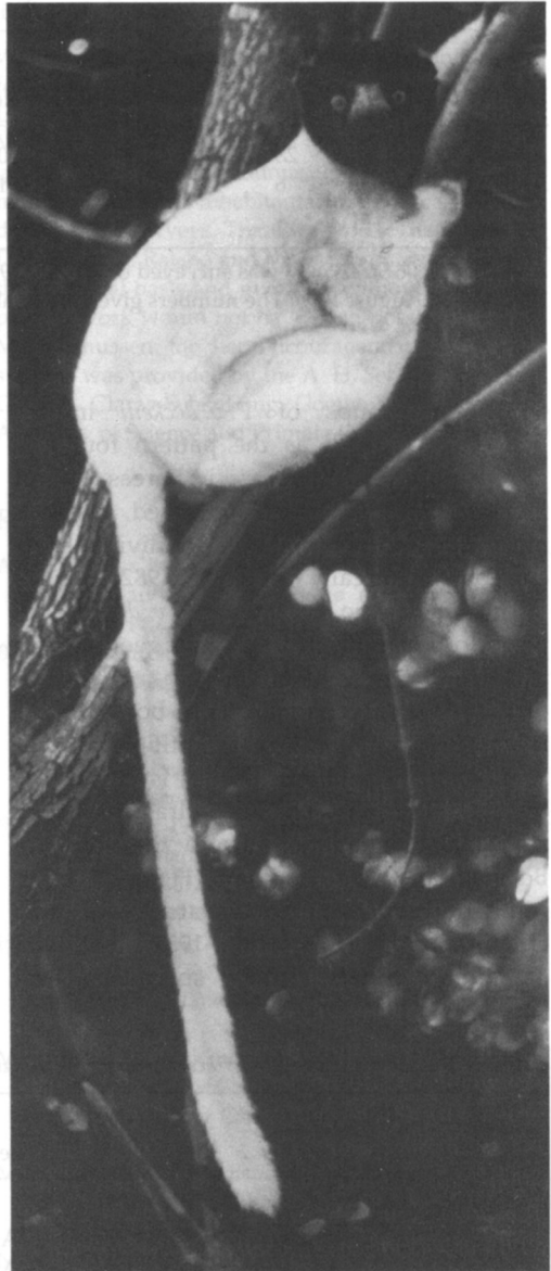
Figure 2e (right). P. v. coronatus.