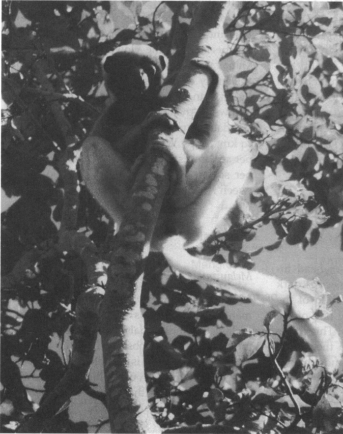
Figure 2c. P. v. deckeni , lighter melanistic form (D. J. Curtis).