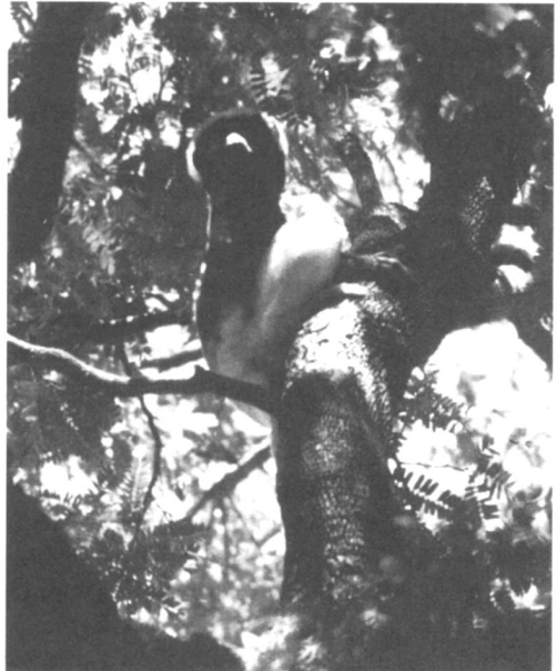
Figures 2a and 2b. P. v. deckeni , melanistic form (D. J. Curtis).